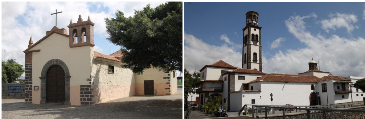
Figure 3. The chapel of San Telmo (left panel) and the main church of Nuestra Señora de La Concepción (right panel). The construction of both buildings dates from the 16th century and are located near the shores of Santa Cruz de Tenerife, where the main ravine, Barranco de Santos, pours its waters into the sea.

On the other hand, half of the churches of Santa Cruz have their axes oriented to an absolute value of the declination close to 10° to 12°, similar to the orientation of La Concepción (Fig. 3), church originally founded under the advocacy of the Holy Cross at the time of the conquest of the island in the very late 15th century. To the best of our knowledge, there is no evident religious festivity that could be related to this orientation (neither the Holy Cross, May 3rd, or the Immaculate Conception, December 8th, work properly), if not the celebration on August 15th corresponding to the main local feast of Our Lady of Candlemas (Nuestra Señora de La Candelaria), patroness of the island of Tenerife. Interestingly, a statue of this lady was worshiped by the Guanches in the abbreviated name of Chaxiraxi , mainly during the first lunation of August, in a festival called Beñesmen , after the time of harvest, even before the Castilian conquest of the island in 1496 (Espinosa, 1980). This would imply that the main orientation is the opposite to the canonical one, from the altar to the gate of the building, a possibility already discussed in Gan-