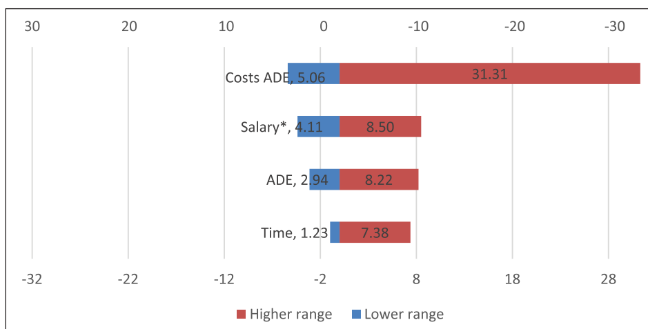
Figure 2. Cost benefit ratios.

Due to the assumption of bi-weekly medication reviews length of stay was not reflected on this table.