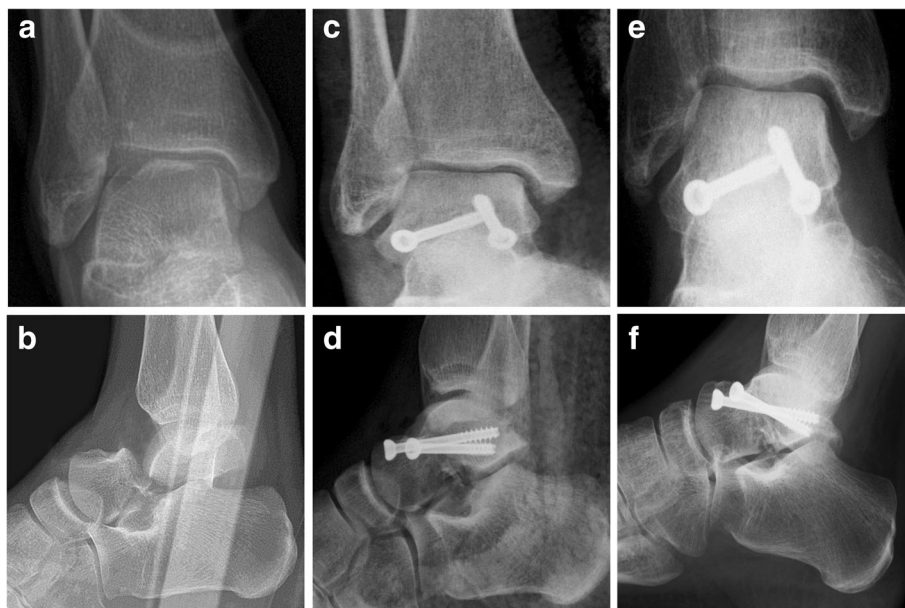
Fig. 1 Case 1: a 40-year-old woman with a Hawkins type III fracture presenting signs of PTA and AVN, but without collapse of talar dome at last follow-up. Antero-posterior and lateral radiographic images at preoperative period (a-b), immediate postoperative period (c-d), 88-month follow-up (e-f)

was noticed, although statistical analysis did not show any correlation ( p > 0.05 ) between timing of fixation and long-term clinical outcomes, even by correlating the scores reporting the best (AOFAS, p = 0.811 ) and worst results (FFI-17, p = 0.488 ) of our cohort (Fig.4).