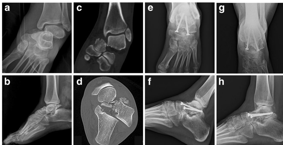
Fig. 2 Case 2: a 41-year-old woman with a Hawkins type IV fracture presenting signs of union despite a disastrous initial condition. Antero-posterior and lateral radiographic images at preoperative period (a-b), coronal and axial CT images at preoperative period (c-d), antero-posterior and lateral radiographic images at immediate postoperative period (e-f), antero-posterior and lateral radiographic images at 51-month follow-up (g-h)

There were 6 (21.4%) malunions, 4 (14.3%) wound dehiscence, 2 (7.1%) cutaneous necroses and a single (3.6%) wound infection. On the other hand, late complications were much more frequent, such as PTA and AVN, affecting respectively 22 (81.4%) and 7 patients (25.9%). Among these last, one (3.7%) suffered only AVN, while the other 6 patients (22.2%) developed both AVN and PTA. The subtalar joint (STJ) was the most frequently affected (14 cases; 51.8%); followed by tibiotalar joint (TTJ) and talonavicular joint (TNJ) (10 cases, 37%; and 9 cases, 33% respectively).