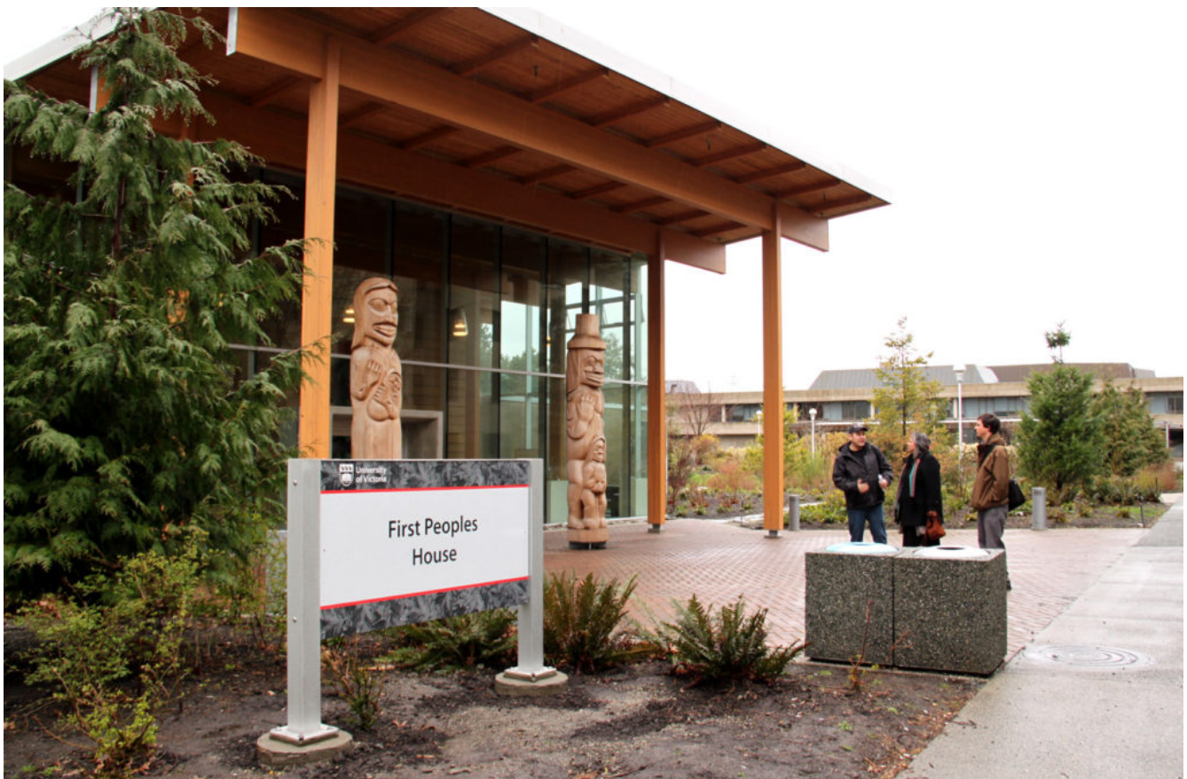
Fig 1.1: First Peoples House, University of Victoria.