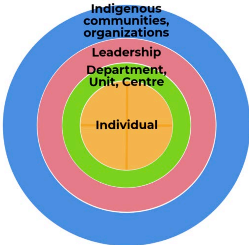
Fig 2.2: Institutional interconnections to Indigenization.

Indigenization in practice is deeply grounded in the traditions and cultural protocols of the traditional landholders that an institution is built upon; it is informed by the diversity of First Nations, Métis, and Inuit of Canada.