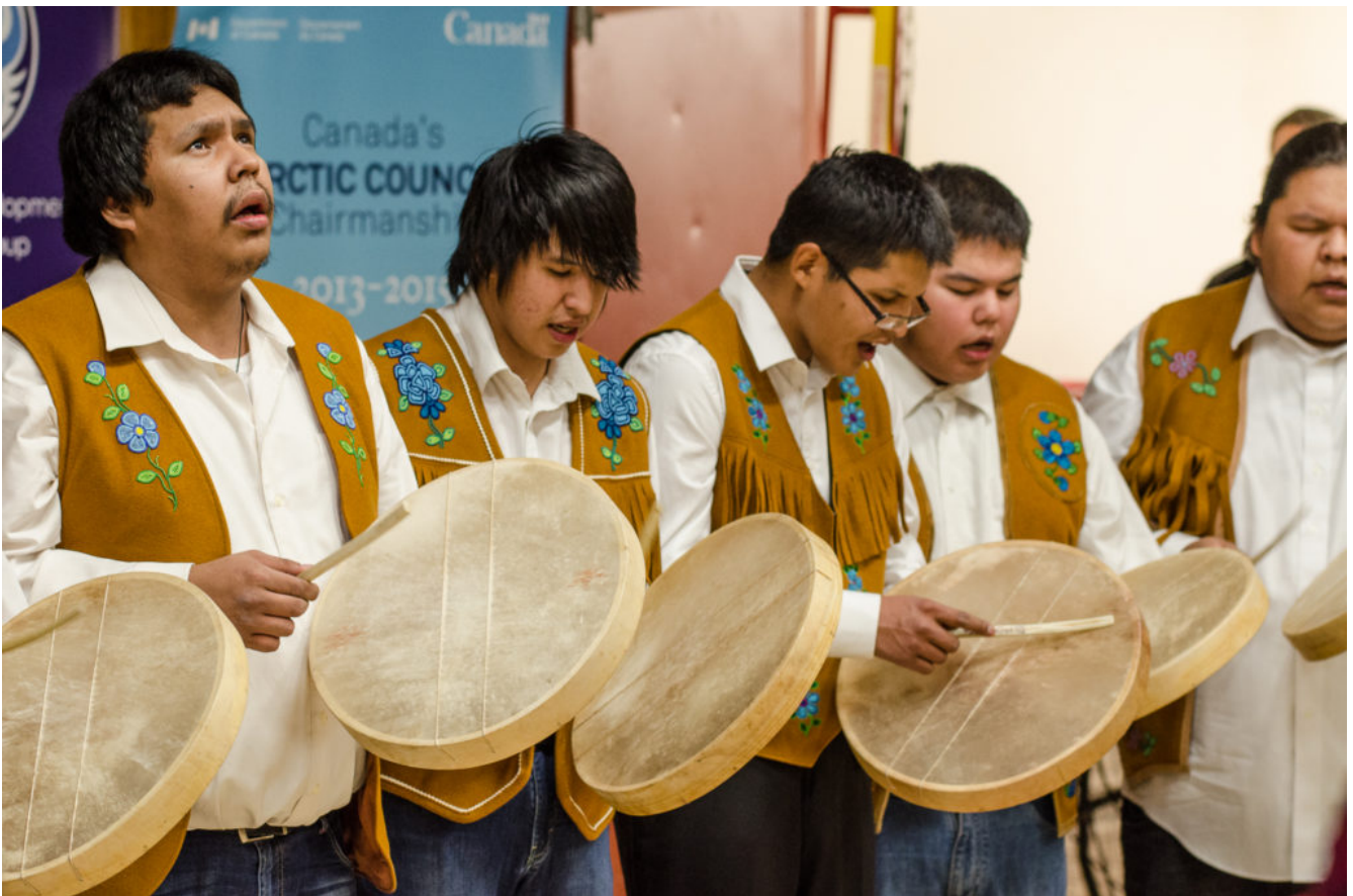
Fig 2.1: The Tlicho Drummers and the Yellowknives Dene First Nation Drummers.