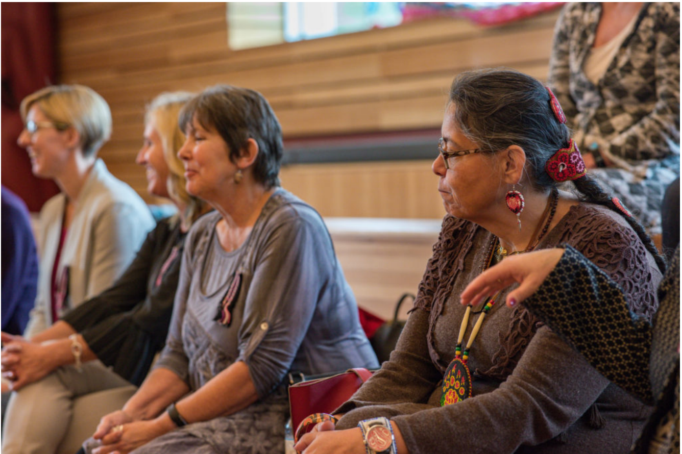
Fig 4.1: UFV – Metis Nation-BC Joint Project Announcement.