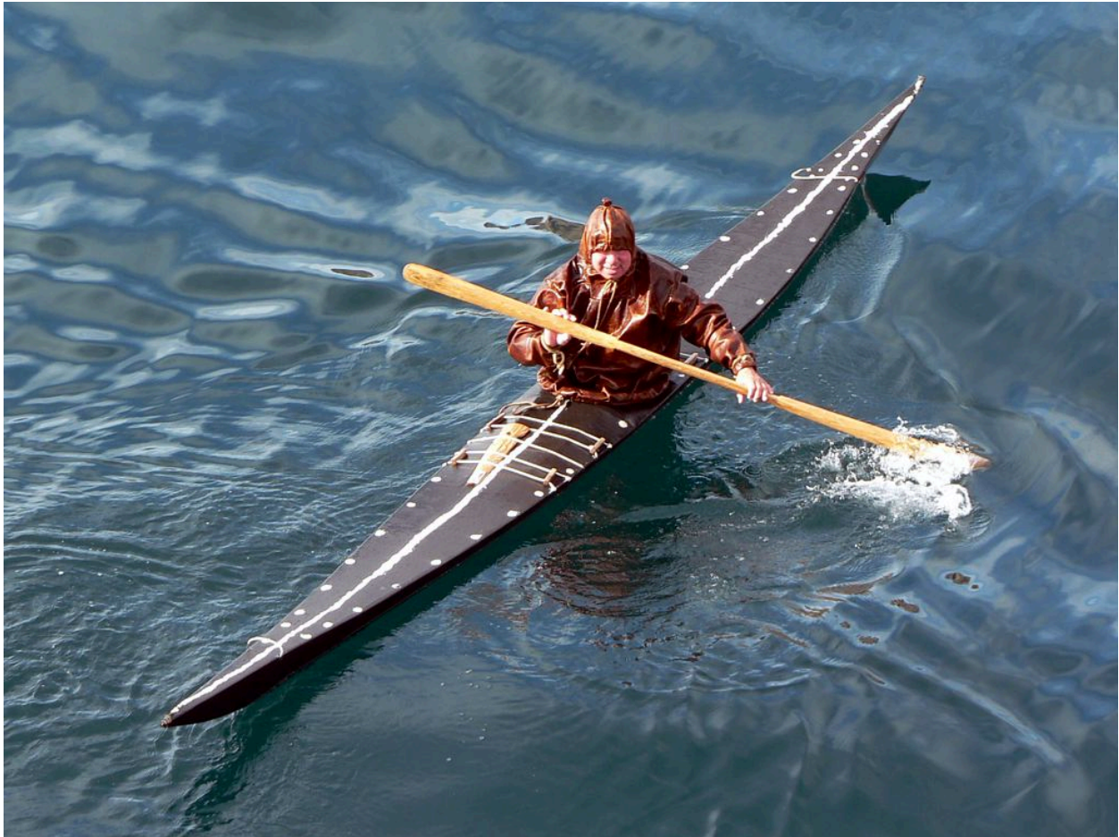
Fig 4.1: Inuit Kayaker