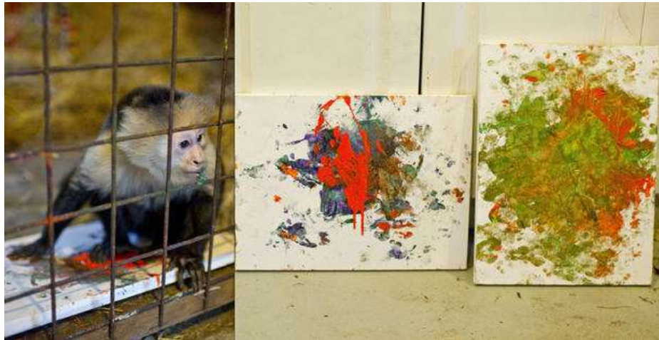
Fig 5. The Painting Monkey (You Tube, see reference 12).

But art is a very important means of communication and it may be also utilized as rehabilitation with good success. This is art therapy or better indicated as expressive not verbal therapeutic activity, better definition than art therapy, since it does not imply an esthetic evaluation, that is not required for the therapeutic finalities. The first ateliers of drawings in psychiatric hospital have been in USA since 1920 and after they have been organized everywhere also outside the Psychiatric Hospitals. In Italy, we remember the important experiences of the Trieste Psychiatric Hospital, The Marco Cavallo, and many others.