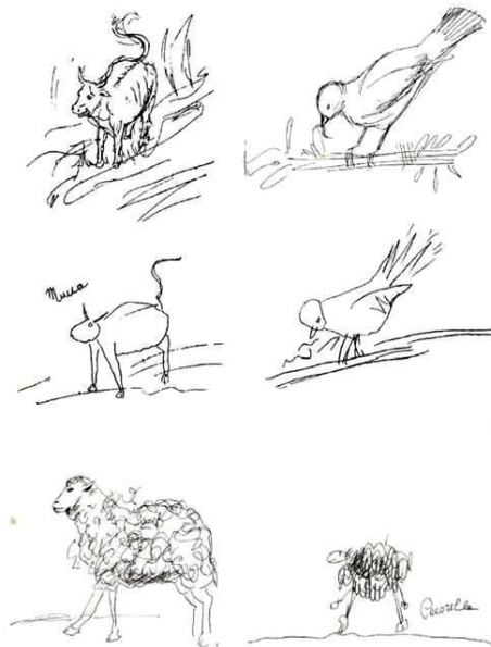
Fig 2. Drawings from a 6 old children, with selective mutism before therapy showing a very good graphic performances, not related with the age , and one year after, when he was able to have a normal verbal communication but the very good graphic capacity have been lost (Reda et al, In Federico A, 1998) (6).

These findings were also reported by Selfe, L. (1977) (7) in autism.