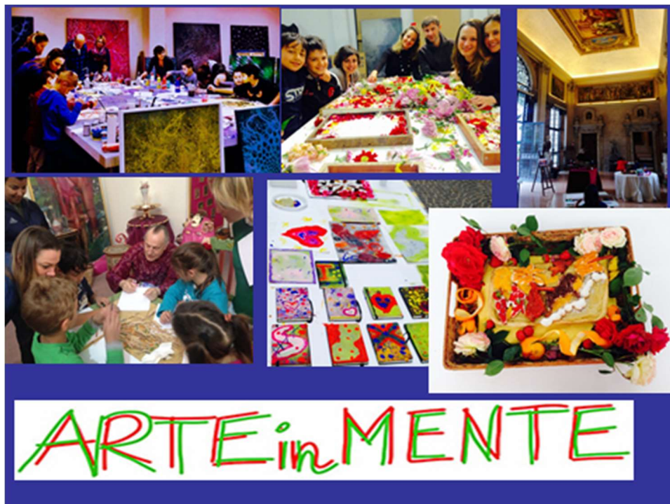
Fig. 6. ARTEinMENTE. Pictures during a workshop with ADHD children.

In a mixed group with typically developing children all child founded his space and his special talent: they experimented the possibility to be out of the rule inside the rule of each workshop.