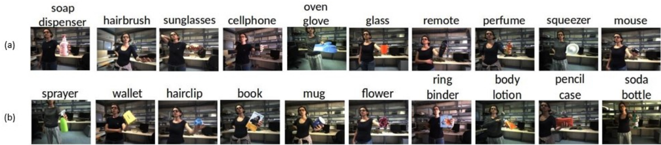
Fig. 3: Example images representing the 10 object instances involved in the first object identification task (PREV-TASK), i.e., the task on which we learn the RPN and the CNN feature extractor (a) and in the second object identification task (TARGET-TASK), i.e., the actual task that is learned on-line (b).