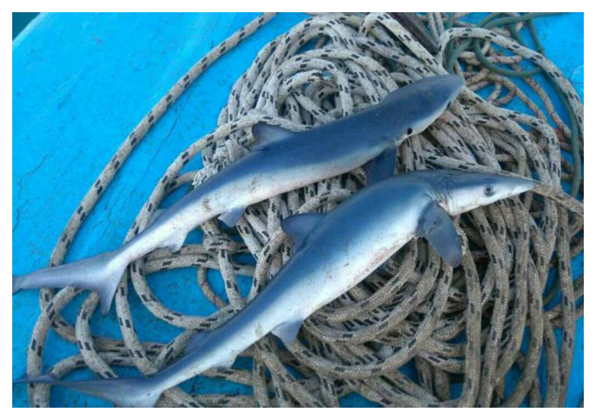
Fig. 3. Two individuals from Trašte Bay

the observation, the depth and the seabed type were noted by interviewing fishermen. For three specimens, of six in total, detailed morphometric measurements were collected. For the other three, no morphometric data is available. This is a result of the lack of information obtained from the fishermen and cases where the specimens were not physically caught, but only recorded using a camera. With the help of the fishermen, we collected the first data on the season and possible parturition grounds of this threatened species within the Montenegrin coastal zone.