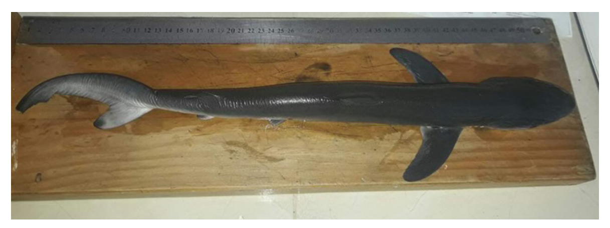
Fig. 1. Dorsal side of the individual caught in Buljarica Cove