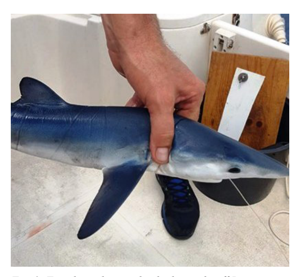
Fig. 2. Fourth newborn individual, caught off Bar

at 221 centimeters in length (PRATT, 1979). In the Mediterranean, gonad observations have shown that females smaller than 120 cm in total length have immature ovaries, while mature ones were present in specimens larger than 203 cm in total length (MEGALOFONOU et al. , 2009).