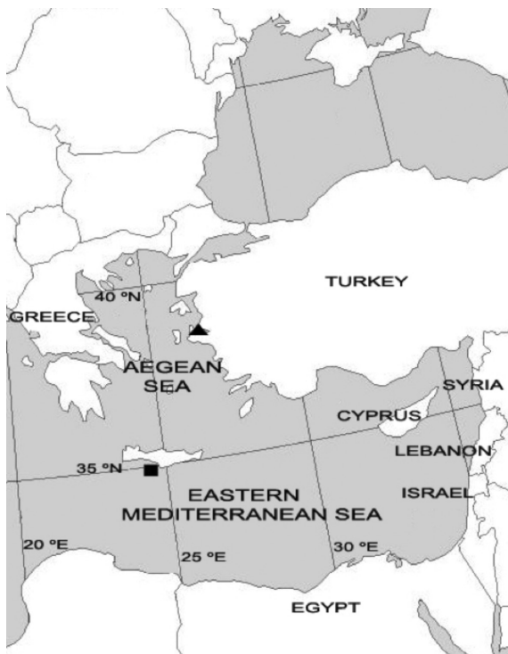
Fig. 1. Earlier established occurrence of Trygaeus communis Dohrn, 1881 in the Eastern Mediterranean Sea (filled rectangle) and the sampling area (filled triangle) reported in this study

SOLER-MEMBRIVES (2014). The specimen was deposited in the ESFM (Museum of the Faculty of Fisheries, Ege University, İzmir).