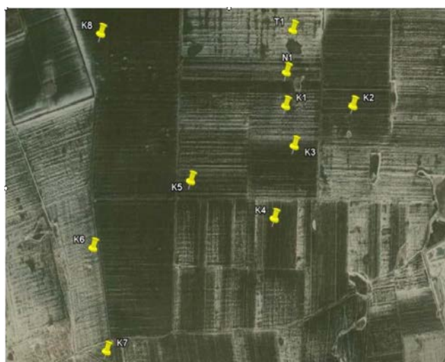
Figure 2: The Woolly cupgrass has been sprading around Debrecen

K1 – Maize 1, K2 – Maize 2, K3 – Maize 3, K4 – Maize 4, K5 – Maize 5, K5 – Maize 6, K7 – Maize 7, K8 – Maize 8, N1 – Sunflower 1, T1 – Stubble-field 1