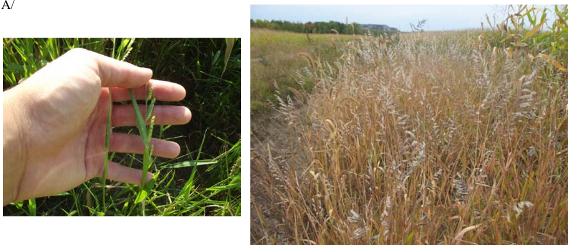
Figure 3: Woolly cupgrass inflorescence branch (A), infesting the edge of a corn field (B/)