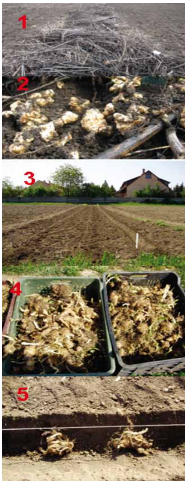
Fig. 1: In vivo propagation of Jerusalem artichoke using tubers: Storing of tubers in the soil during winter season (photos 1 and 2); preparing soil for cultivation (photo 3); sprouted tubers, which cultivated in the field in April (photos 4 and 5)