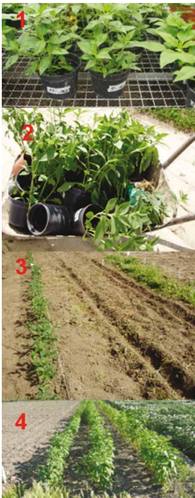
Fig. 2: In vivo propagation of Jerusalem artichoke using transplants: cultivated tubers in pots in green house (photo 1); produced transplants ready for cultivation (photo 2); cultivated transplants in the field (photos 3 and 4)