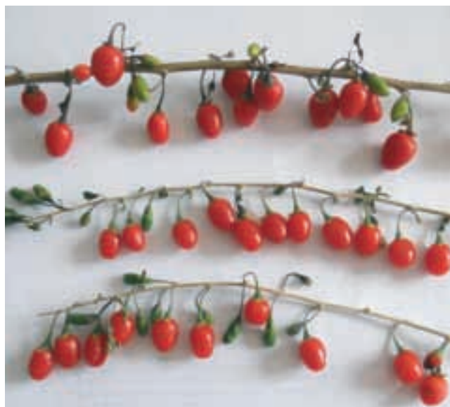
Figure 1. Comparison of Lycium fruit (berry) size, 2011.

The clone No. 55 significantly did not differ from the 29 clone applied as the control, but it had higher fruit weight by 8%.