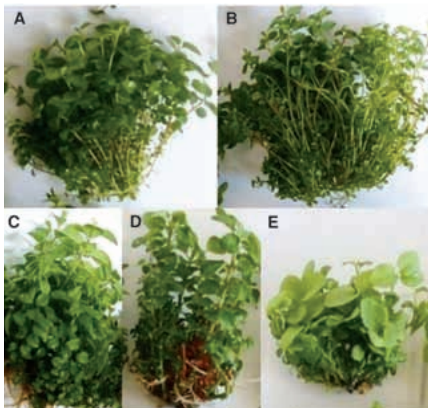
Figure 3. In vitro shoots of Amelanchier canadensis 'Rainbow Pillar' developed on media gelled with either 6.8 g l -1 fibrous agar-agar (A); or 20.0 g l -1 Guar gum (B); or 50.0 g l -1 wheat starch (C); or a blend of 50.0 g l -1 wheat starch and with 0.5 g l -1 Phytigel (D); or 15 g l -1 Isubgol (E).

Blends of agar and other gelling agents can be effective and cost-saving possibilities (Mohamed et al., 2010; Dobránszki et al., 2011). Ebrahim and Ibrahim (2000) observed