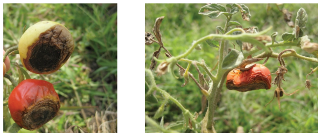
Fig. (3 and 4): Tomato fruits infected with Rhizoctonia soil rot disease.