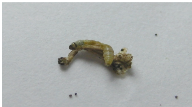
Fig.(1): Infested larva after Trichoderma viride treatment.

Concerning the infested tomato fruits percentages with T. absoluta larvae in season 2011 were arranged in ascending