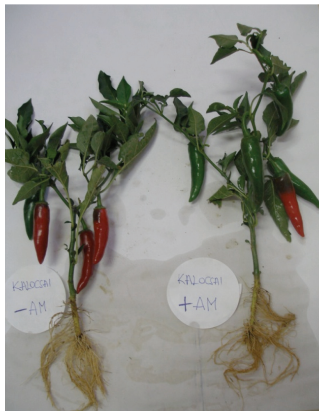
Figure 2. AM-treated and non-treated Capsicum annuum L. var. longum cv. Kalocsai .

Besides the activity of external hyphae of AMF, arbuscular mycorrhizal fungi directly or indirectly affect the soil ecosystem through multiple interactions with other soil organisms. Although they are not saprotrophs, AMF can enhance the rate of decomposition of organic material (Hodge et al. , 2001), indirectly influencing decomposition