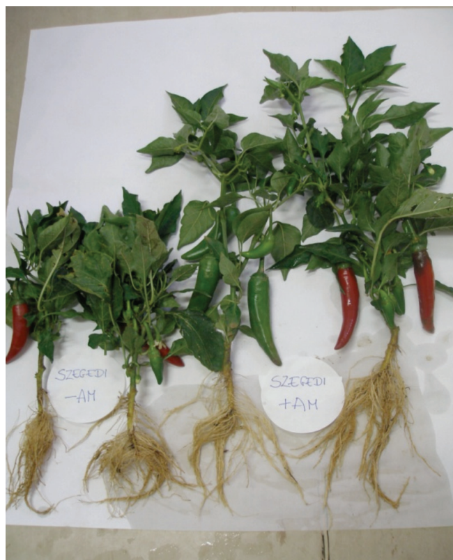
Figure 1. AM-treated and non-treated Capsicum annuum L. var. longum cv. Szegedi .

Values followed by the same letter are not significantly different, P \leq 0.05 , Tukey test. Values are means of five observations.