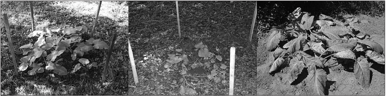
Figure 1. Telekia speciosa (Schreb.) Baumg at semi shadow (left), at shadow (middle) and at sunny (right) habitat.