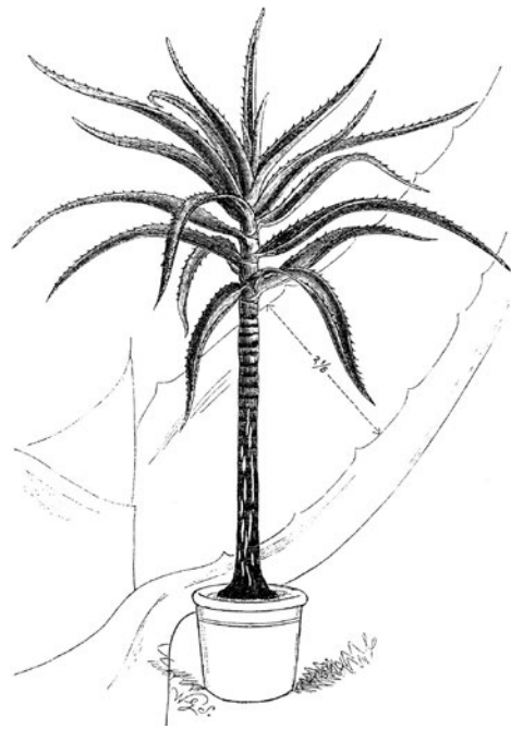
FIGURE 1.— Aloe barberae (now Aloidendron barberae ), from the plant growing at Kew (from Dyer 1874a: Fig. 117).

sorry the specimen branch is much broken but a [porter] already loaded had to carry it through a bushy country and 90 miles more of carriage by Wagon and Bus has not improved it.' On his mediocre illustration he ruefully remarked. 'The sketch also had to be made on the march when we were all pretty well tired and coloured when halted at Mr Hill's the nearest farm house ...'. The larger figure was published in The Gardener's Chronicle as a woodcut (Figure 2), produced from a drawing by an unknown artist, but based on a watercolour painting (reproduced in Van Jaarsveld & Judd 2015: Figure 16). This image depicts the type locality near Greytown, with the aforementioned expedition member climbing a tree to secure material. This represents a fascinating translation of the original Baines watercolour (220 × 350 mm) sent to Hooker, in which Baines – as was his wont – included himself within the very scene. A black and white reproduction of the original painting is also reproduced by Wallis (1976: