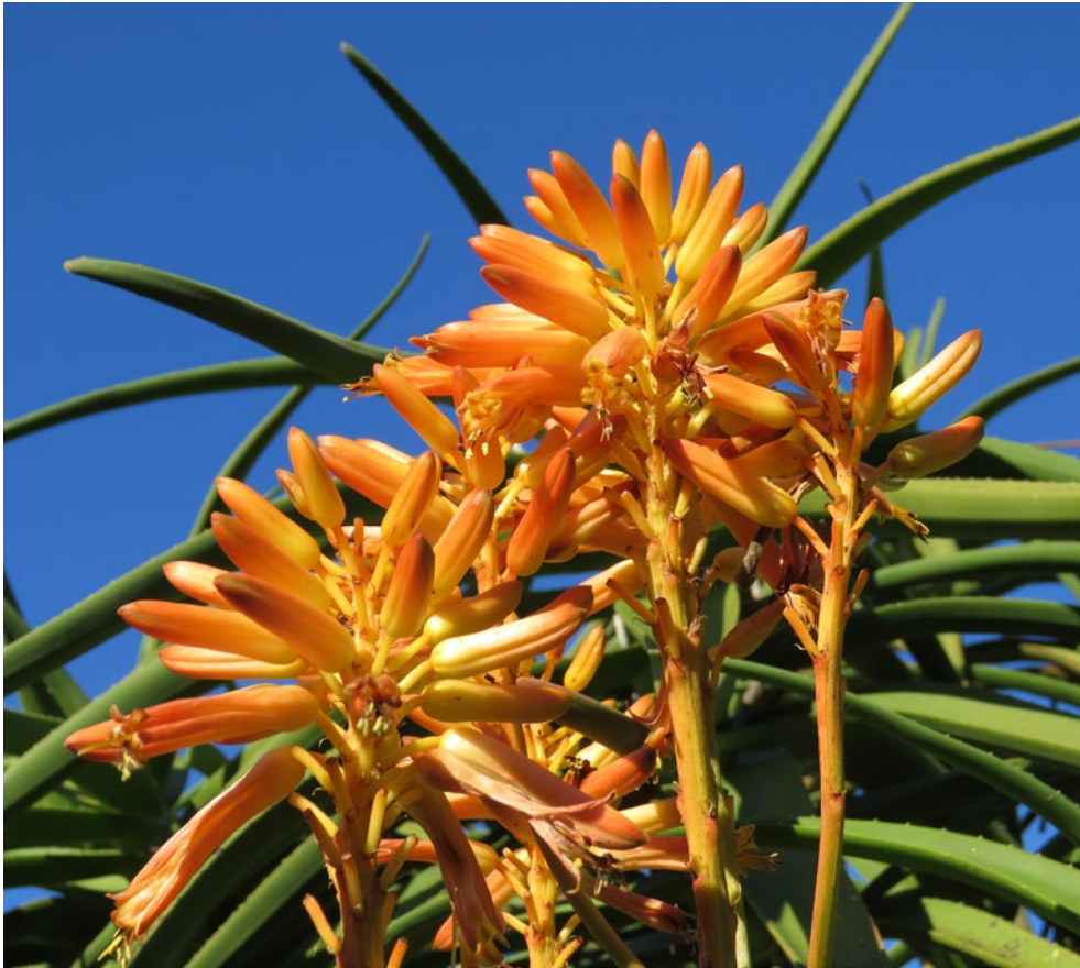
FIGURE 6.—The flowers of Aloidendron tongaense are yellowish orange and, in contrast to A. barberae , the stamens are only shortly exserted, for up to 5 mm.

treatment) are all identified as A. tongaense . Besides herbarium specimens, sight records by one of us (EF) (Figure 4) vouch for the occurrence of A. tongaense in southern Mozambique. The latest publication on the trees and shrubs of Mozambique (Burrows et al. 2018) also treats only A. tongaense . It seems as though A. barberae is not actually present in Mozambique, but further fieldwork would be useful to confirm this. We suggest initially exploring the southern Lebombos of Mozambique to the immediate southeast of Abercorn (Swaziland); large specimens of A. barberae have been observed by one of us (NC) (Figure 8) near Border Cave, 23 km southwest of Abercorn.