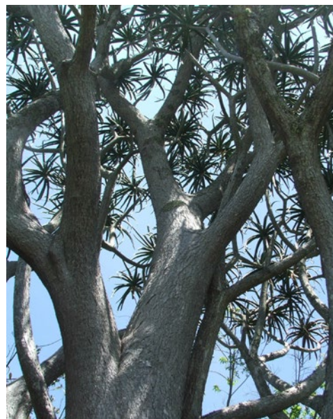
FIGURE 9.—A magnificent specimen of Aloidendron barberae growing on the Matthew's Rockery at Kirstenbosch, illustrating the architectural nature of its branching pattern.