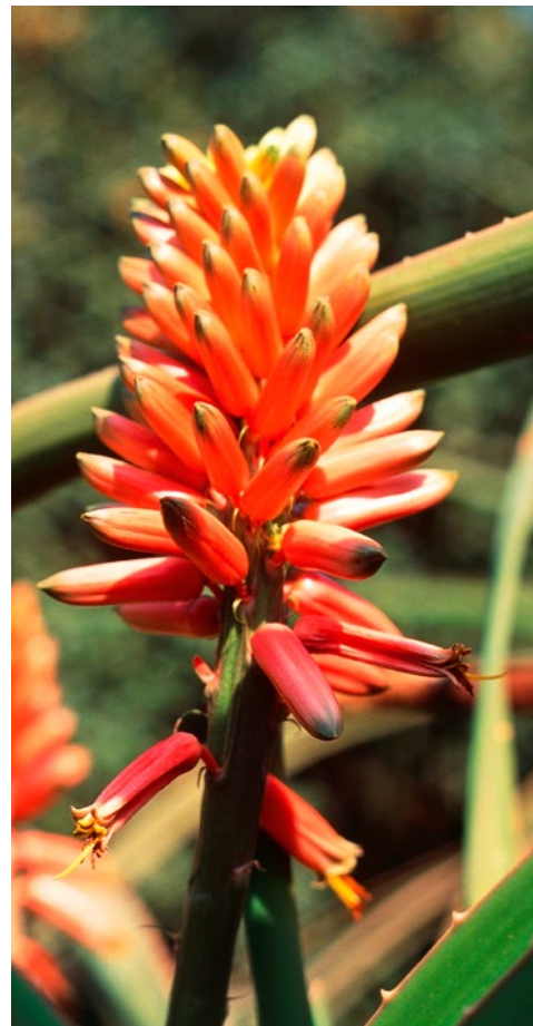
FIGURE 5.—Close-up of the rose-pink, green-tipped flowers of Aloidendron barberae. In the case of this species the stamens are usually well-exserted to 15 mm at anthesis.