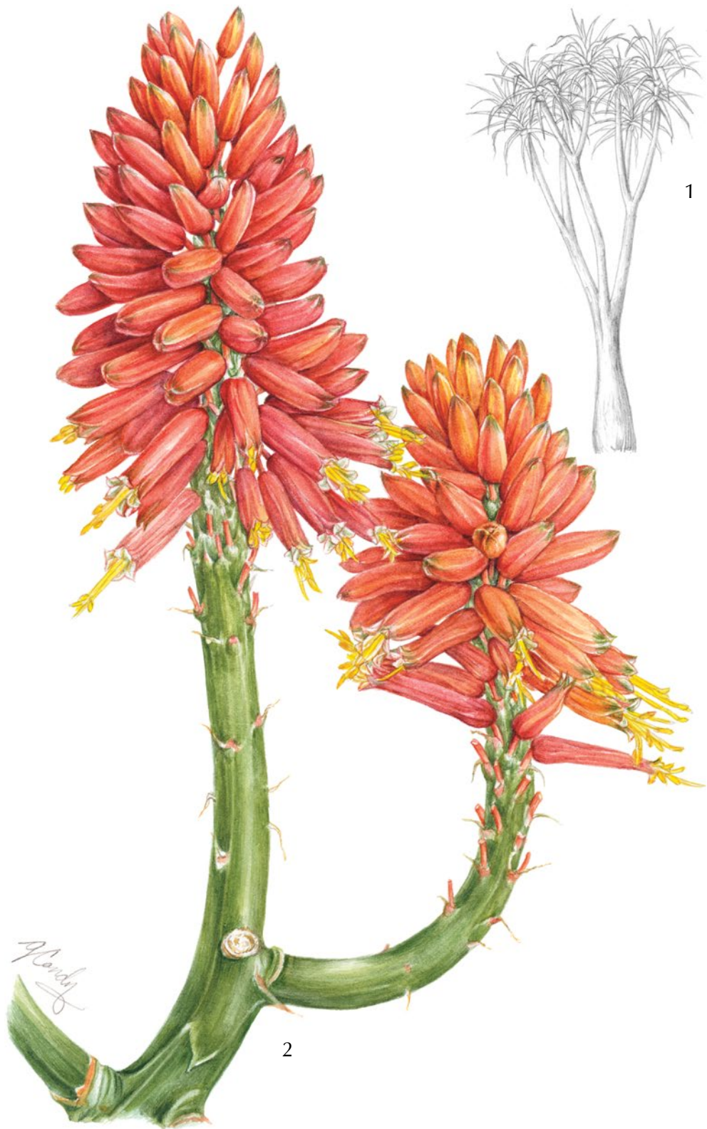
PLATE 2342 Aloidendron barberae