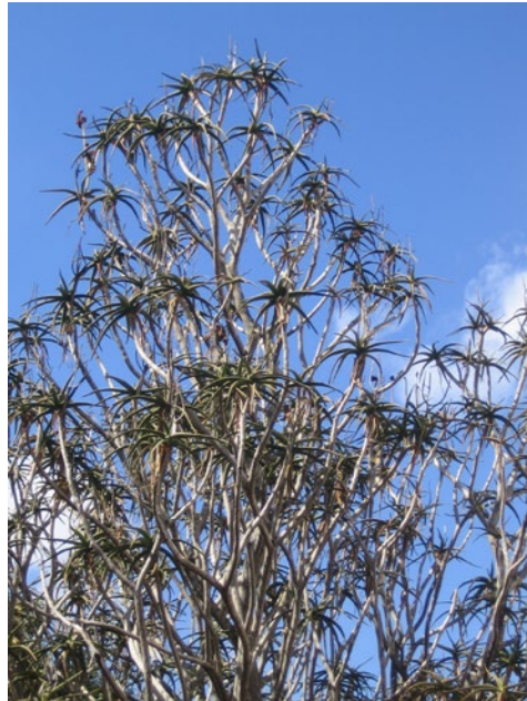
FIGURE 4.—Typically reaching a height of up to 8 m at full maturity, Aloidendron tongaense trees, here photographed on the outskirts of Maputo, Mozambique, usually do not grow as tall as those of A. barberae .

on the ends of their branches, which keep forking into two, like the dome [douw] palm. The trunk, a yard above the ground, is quite two feet through. When in bloom, every head has a bunch of “red-hot poker flowers” coming out of it, and the mass of scarlet can be seen 30 miles off, Mr. Hill says’ (Saunders 1979). North’s excellent painting of the Verulam plants hangs in the Marianne North Gallery at Kew as painting number 383 (Anon. 1914) and was reproduced in Anon. (1980: 215).