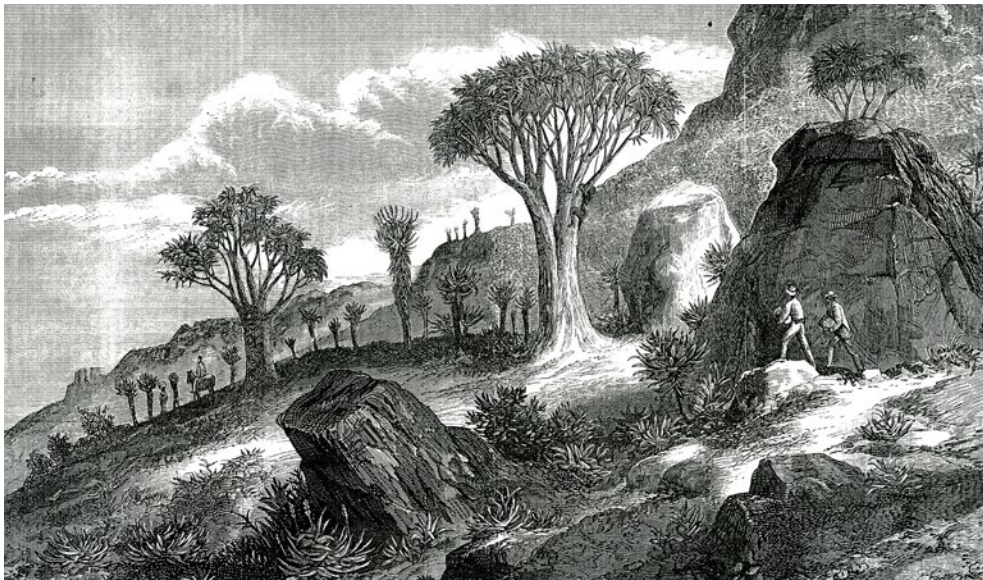
FIGURE 2.— Aloe bainesii (now Aloidendron barberae ) growing on rocky hills near Greytown in the Thukela River Basin, KwaZulu-Natal. Woodcut based on a watercolour by J.T. Baines 2 July 1873 (from Dyer 1874a: Fig. 120).