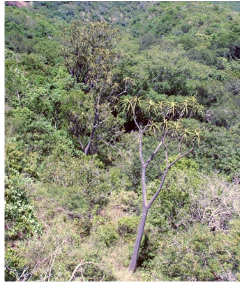
FIGURE 8.—Trees growing on rhyolitic soils near Border Cave on the South Africa–Swaziland border, southeastern Lebombo Mountains, South Africa.

Propagation is through stem cuttings or truncheons – such is their ease of rooting