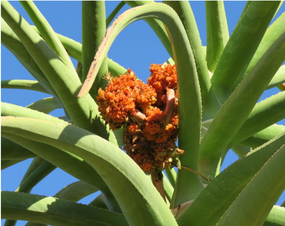
FIGURE 10.—The inflorescences of Aloidendron barberae are particularly prone to infestations by aloe cancer mites.

that production using seed is rare. Cuttings can be taken at any time of year, left to dry for a few days, and then placed in a coarse, sandy soil mixture; roots will soon develop. In production and wholesale nurseries, the terminal sections of branches are sometimes removed to break apical dominance and stimulate the formation of small, rosulate shoots that can easily be excised with a sharp knife. However, it is considerably more difficult to relocate mature trees. Such plants weigh several tons and moving them presents extensive logistical challenges, the solutions to which may involve cranes and flatbed trucks. Once the root systems of such trees have been severely damaged, plants often die an inexorably slow death as they are starved of water and nutrients. However, if such mature trees have been successfully established in enormous, industrial-scale planting bags, trees can be more easily transported and will flourish once well-rooted in a new spot.