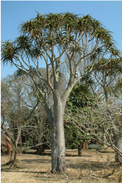
FIGURE 3.— Aloidendron barberae in cultivation in Hayfields, Pietermaritzburg.