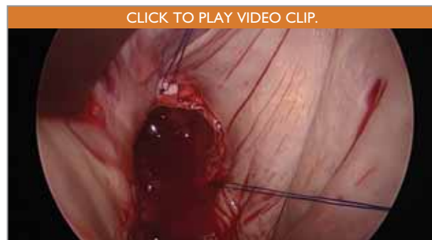
FIGURE 5: The valve after a second deployment sitting significantly less atrial and no leaks were seen. The pledgeted sutures seen were then used to put anchor sutures through the struts of the stent.