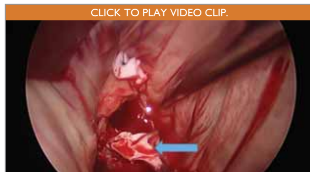
FIGURE 3: After plication of the antero-lateral commissure, the A2 portion of the anterior leaflet was resected together with its chords – the blue arrow indicates the A2 segment as it is pulled out.