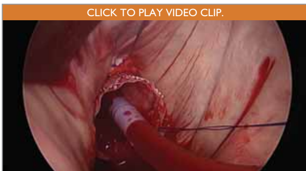
FIGURE 4: The Edwards SAPIEN XT valve after the first deployment. Note how much of it is visible on the atrial side. A paravalvular jet was seen at 10 o'clock and the valve was removed.