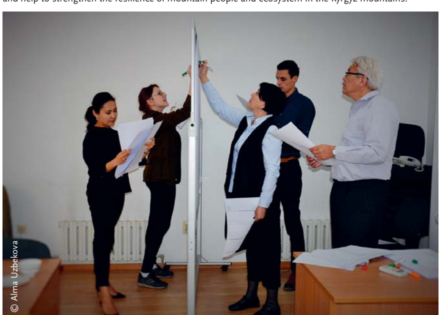
FIGURE 2: Experts in Kyrgyzstan assess the interactions between SDG targets that are of high priority and help to strengthen the resilience of mountain people and ecosystem in the Kyrgyz mountains.

As part of the SMD4GC program initiated by the Swiss Agency for Development and Cooperation, the Mountain Research Initiative<sup>4</sup> and the Centre for Development and Environment at the University of Bern, Switzerland, have been developing initial steps for an approach to assess sustainable mountain development using the SDGs. In collaboration with SMD4GC partner organizations, expert assessments were conducted in Nepal, Uganda, Kyrgyzstan, Ecuador, and Switzerland to identify local development priorities (Wymann von Dach et al. 2018) (figure 2). Due to locally specific socio-economic contexts, it is not surprising that the expert assessment revealed priorities specific to each of the five countries. For example, in the Swiss Alps demographic and structural changes in agriculture were considered as critical targets, whereas the experts from Kyrgyzstan and Ecuador raised the control of mining on their lists of key challenges, and in Uganda land conflicts and fragmentation were highlighted (Wymann von Dach et al. 2018).