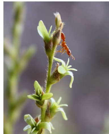
Fig. 1 Pseudomyrmex mordax worker ant patrolling over a Triplaris americana inflorescence

Plant and ant material were collected close to Quebrada Hemayacito, near to Pringamosal-Guamo, Tolima,