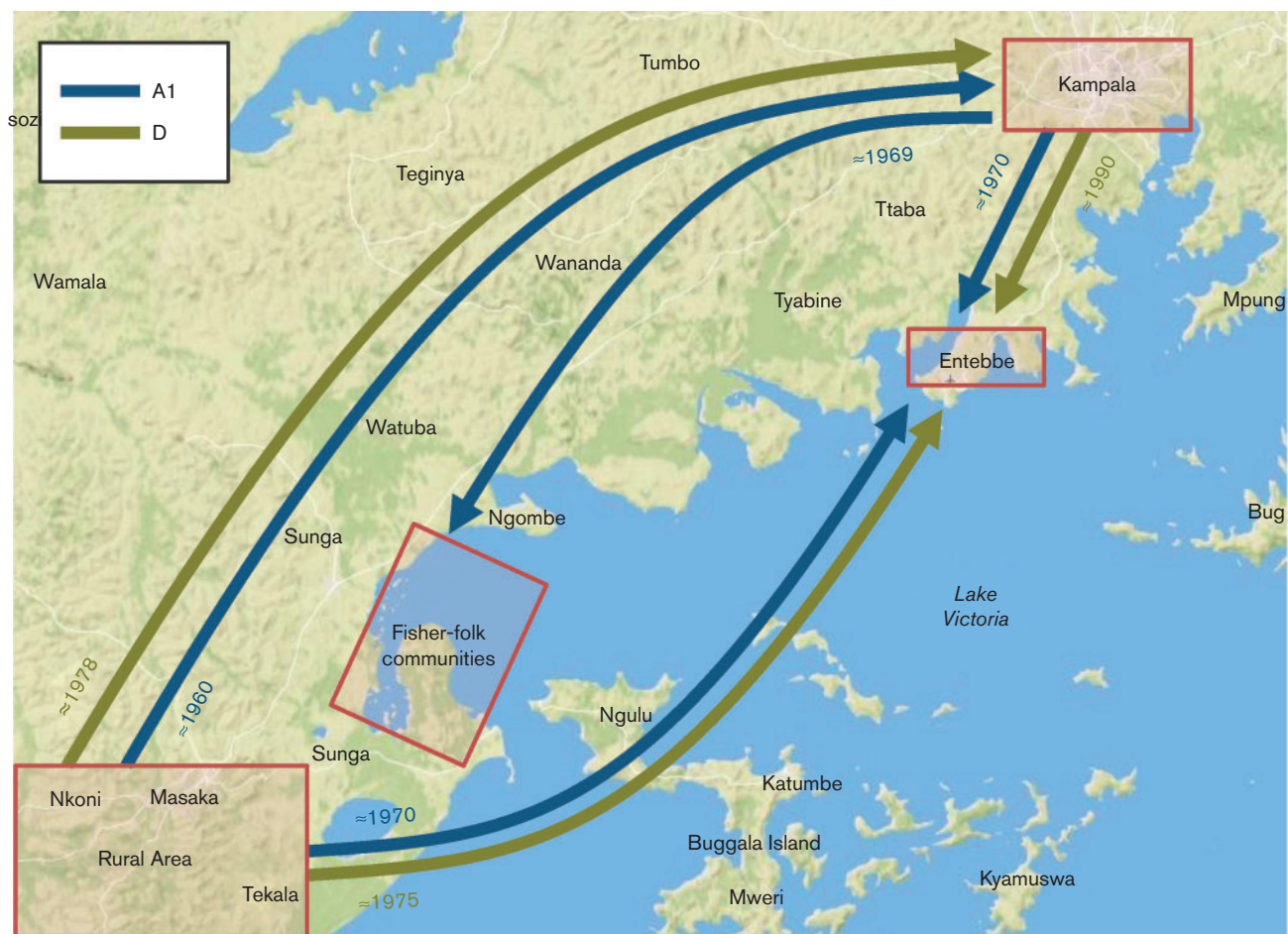
Fig. 3. Inferred routes of HIV subtypes A1 (in blue) and D (in green) spread between the four Ugandan locations considered, highlighted with red rectangles. Only the statistically significant routes (supported by BF >3) are shown. The dates accompanying each arrow indicate approximately when these movements occurred in time. This figure was constructed using maps from MapBox ( www.mapbox.com ).

We have reconstructed the history and spread of the predominant HIV-1 subtypes in the Ugandan Lake