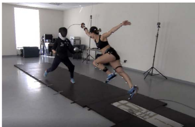
Figure 1. Straight touch employing flèche .

With regard to the lunge, the rear leg is applied to initiate the attack with the forward lower limb in a movement performed in the upward and forward direction. It is postulated that the attack should be performed at the instant corresponding to the maximum extension of the elbow joint and before the front foot has hit the ground [7]. In the case of the flèche , the movement pattern is initiated by the dominant arm, and the attack is executed as a result of the activity of both legs simultaneously. Of note, the forward leg is applied to initiate the pattern, and a higher load is exerted on this leg to generate significantly greater values of power. The flèche is executed in a pattern in which the fencer touches the ground with their rear leg immediately before the attack. At this instant, this leg acts as the support as it prevents the fencer from falling [8]. Visualizations of both the lunge and flèche patterns are presented in Figures 1 and 2. These movements are performed by the World Champion, Ms. Danuta Dmowska, who gave consent for the publication of her image.