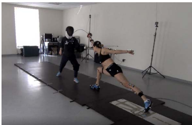
Figure 2. Straight touch employing lunge.

We emphasize that visual and even video assessments are not capable of demonstrating the complexity of the technical structure of the touch pattern, which can only be verified by the EMG record involving the activity of the important muscles involved in these attack varieties [9]. The authors of the present work were guided by the idea that the research should be performed in conditions that are similar to the actual fencing training. On the basis of that finding, practice of the flèche and lunge was performed with the involvement of the coach in the training. The practice was designed so that the body of the coach along with the blade had the coordinates of the hit area marked with