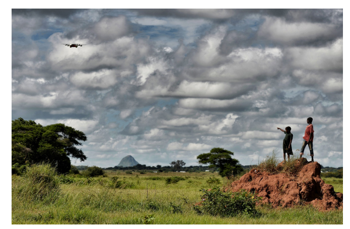
Figure 1 Drone flying in Malawi (March 2016).

information within the routine health information system is recommended. For example, 'dispatched and received' logs about payload should be linked to the existing stock registries in health facilities.