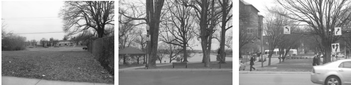
Figures 6-4: Examples of possible anchors located between the stream valleys to determine future greenway network route- vacant land, public park, and existing infrastructure corridors

As the greenway network brings more social connectivity in and between neighborhoods there emerges the next phase of addressing how to activate underused land along the route in an economically and ecologically productive manner. Four categories of future land use to consider along this new greenway network are public works assistance, public open space, regenerative land, and productive land. Looking at the new greenway network through these lenses will offer design interventions which help define the greenway as more than just a connecting route, but as an emerging and cultural and ecological amenity that is adapting to new forms of economy and geography.