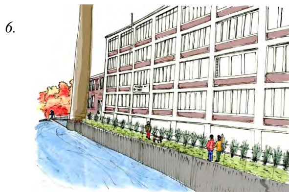
FIGURE 3: EXAMPLE PROPOSED BY GELLER OF A RIVER WALK ACCESSIBLE TO THE PUBLIC.