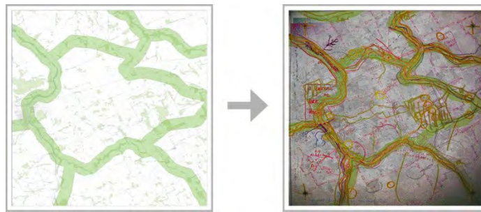
Figure 10 | Original NGN and adjusted design charrette outcome

(Condon 2008) gave the opportunity for participants to ‘ground-truth’ the NGN design. This resulted in spatial adjustments to the NGN based upon their own local knowledge and expertise and refined the design from broad conceptual corridors and linkages derived from an ecological modelling process (McRae & Kavanagh 2011) to more precise and feasible designs (Fig. 2). The reconfiguration and realignment of the NGN by charrette participants did not reach a final resolved design (i.e. one that could be implemented). It did however confirm the potential of the NGN as a broad spatial framework which could then be adjusted and refined through local input. It was also noticeable how participants in the charette seemed willing to ensure that their local area would meet the overarching aims of the NGN, ensuring a broader focus to the exercise. Two ‘rules of adjustment’ to which the design was altered emerged from the charrette. First ‘Form’: the re-alignment of the NGN to landscape elements such as remnant vegetation, roads and cadastre. Second, ‘Function’: an exploration of multi-functionality and potential for novel ecosystem approaches to revegetation and ecological restoration.