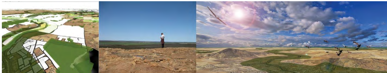
Figure 13 | Examples of the visualisation of the NGN: Google Earth; on-site with AR; and CGI.

As spatially accurate plans with encoded geo-spatial information, exploration is possible at the desktop with freely available Google Earth files, in situ via Augmented Reality (AR) with smart phone or GPS and/or by Computer Generated Image (CGI) in hard copy or on screen or website (Fig. 5).