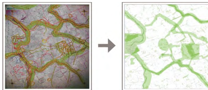
Figure 11 | A digitised version was created from the design charrette outcome

In order to create accurate and measurable designs that could be recognised for their potential benefits a translation of imprecise drawings to the digital was made (Fig. 3). To remain without bias this occurred through precise redrafting of the charrette informed by the revision of notes, recorded discussions and adherence to the rules of adjustment established at the charrette. Consequently, drawing inaccuracies were rectified where in conflict with the charrette intent.