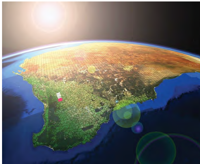
Figure 9 | NGN as framework across the south-western Australia, showing the location of the York study area