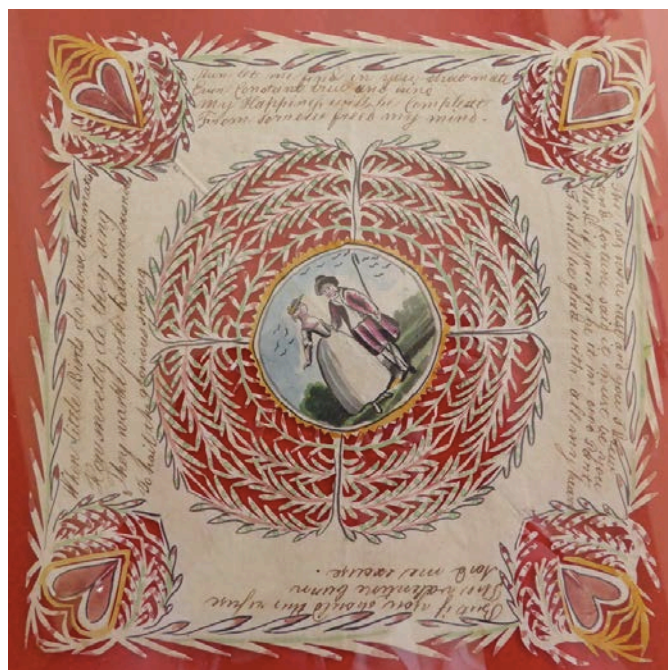
Figure 1. Cut paper valentine with watercolour decoration and handwritten verse, sent from Manchester to Liverpool, 14 February 1783, Temperley Collection.

Valentine cards provide valuable clues for historians about the languages and practices of romantic love. They also provide important and overlooked evidence of a society in flux, responding to the growth of commerce and industry through the invention of new traditions. 3