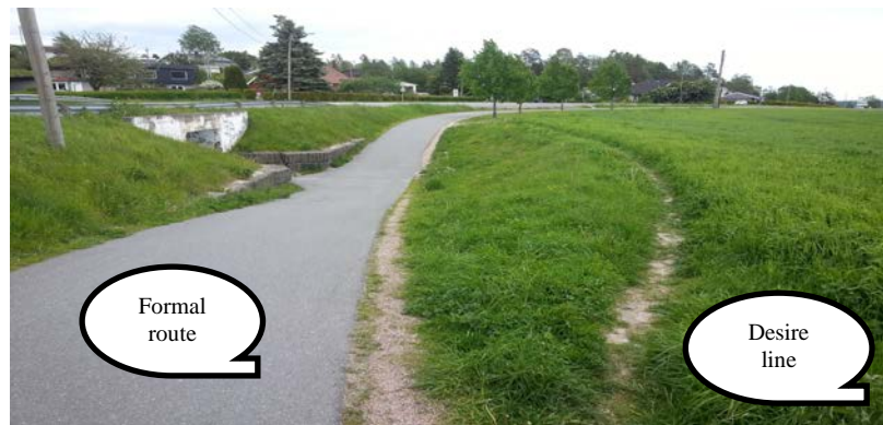
Figure 1: Desire line (adapted from https://i.imgur.com/HPJEMs7.jpg )

Despite being a relatively well-understood physical phenomenon in the related fields of physical geography and urban planning, desire lines - also known as desire paths, cow paths, pirate paths, social paths, game trails, social trails, Chemins de l'âne (donkey paths), kemonomichi (beast trails), and Olifantenpad (elephant trails) - lack a robust, inclusive definition. Even the origin of the term itself is debatable. The French philosopher Gaston Bachelard is often cited as the originator of the term 'desire lines', in his 1959 work 'The Poetics of Space' (Bachelard, 1959). However, the work itself makes no explicit mention of desire lines or desire paths.