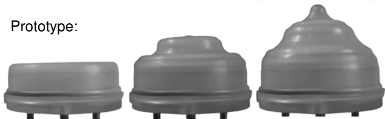
Fig. 1: Snail with tentacles (l.), finite element model and prototype under increasing internal pressure load (r.)