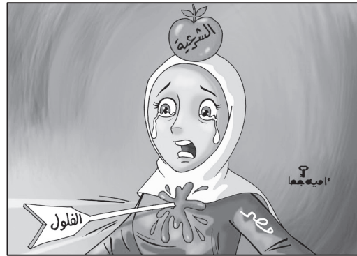
Cartoon (6) 63

C1) Visual Depictions: Cartoons that observed the will of the Egyptian people, focused mainly on the unity among Egyptians, and the public agreement to end Morsi's regime. A large number of cartoons depicted Egyptians as unified under one flag that says, "Go, Loser!" (see Cartoon 5). In this cartoon, the Egyptians are surrounded by pyramids, churches, mosques and palms. 64 In another cartoon published in Al-Ahram , people are shown to build a pyramid with their bodies and hoist the country's flag 65 because Egyptians cannot take the mistakes of the regime anymore and will explode 66 .