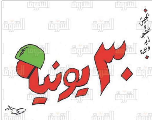
Cartoon (3) 43