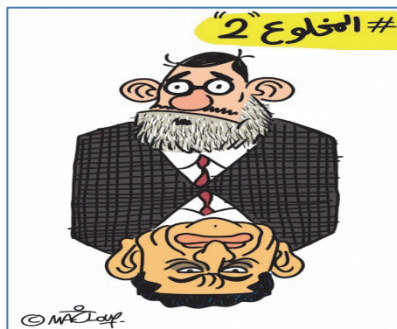
Cartoon (1) 1