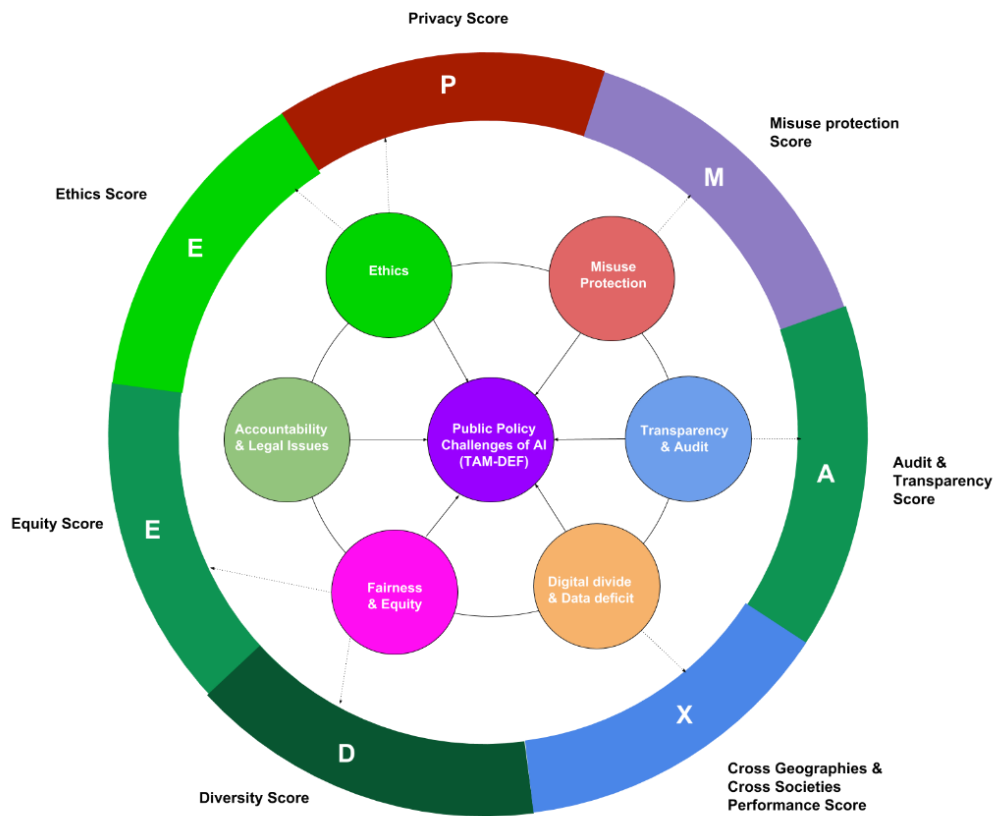
Figure 4: An integrated view of DEEP-MAX Scorecard under TAM-DEF framework for Public Policy challenges of AI