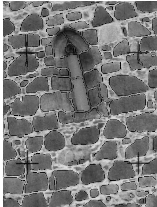
Fig.3: Automatically extracted stones

An other possible solution is the use of more geometric or radiometric parameters and topological relationships, especially for the assignment of the corresponding interest points in the feature based approach.