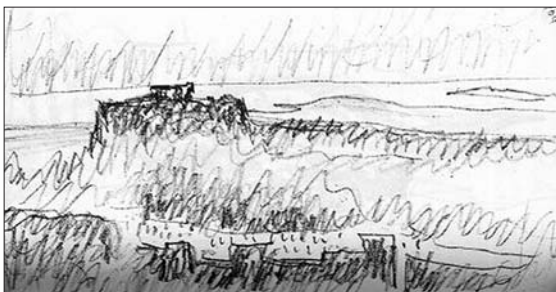
2 | The very first sketch Le Corbusier drew of the Acropolis

Sigmund Freud provides a possible explanation for Corbusier-like anxiety as well as for the silence of the gaze. 20 The eighty-year old Freud wrote about his experience on the Acropolis, titled A disturbance of Memory on the Acropolis 21 , 32 years after having visited it. Freud's text is not another travel narrative. He readily acknowledges having had such an experience, and then sets out to dia-