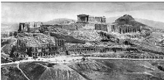
3 b | Photograph in Mabel Moore's "Days in Hellas", 1909