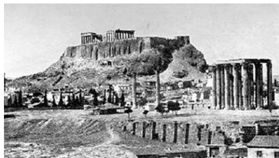
4 b | Photograph in Mabel Moore's "Days in Hellas", 1909

3 a, b | The same or similar generic images would be used by different travel narratives. This was one of the most common images and Corbusier's first sketch of the Acropolis is also from this very spot. It is possible that Corbusier was influenced by this generic image.