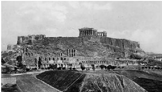
3 a | Frontispiece in J. P. Mahaffy's "Rambles and Studies in Greece", 1900

This is precisely what did not happen at the Acropolis. The representation, the visual sign that stood for the Acropolis was inadequate. The actual Acropolis was not subsumed under it, it exceeded that it was called upon to represent: it exceeded its visual image. The specific challenge of viewing the Acropolis then was, even as a constructed convention, that it demanded not to be viewed as another building, or as a row of columns etc., but rather as architecture's datum, as its perfection;