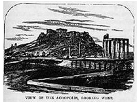
4 a | Illustration in Mark Twain's "Innocents Abroad"