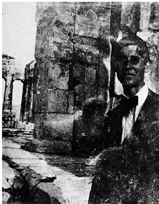
1 | Photograph of Le Corbusier on the Acropolis

Here the architect's gaze must be brought in: the architect appears not so much as incapable of breaking the aura, as uninterested in doing so. He is rather more interested in inventing new representations for the monuments, that is of adding another layer to the aura. A case in point is Le Corbusier (fig. 1). His travel narrative, titled Voyage d'Orient 14 was a pilgrimage of self-becoming, a Bildungsroman-narrative. Athens, the Acropolis