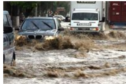
Fig.1 Urban Flooding (Bacău, 2005)

Only this year Romania was stroke by four major floods, causing damages estimated at over 2 billions EU. Over 25.000 houses were wrecked, 40 people lost their lives, and hundreds of km of roads, railways and bridges were affected[5]. Tornados, a phenomena new in the region, caused smaller catastrophes, comparing to the land slides produced by the unusual quantity of rainfall. Due to the disasters caused by floods (fig.1), it is necessary now, more then ever, to take advanced care for the environmental protection and improvement of the urban environment, which can bring several advantages in the urban planning, and also in the zonal planning [4].