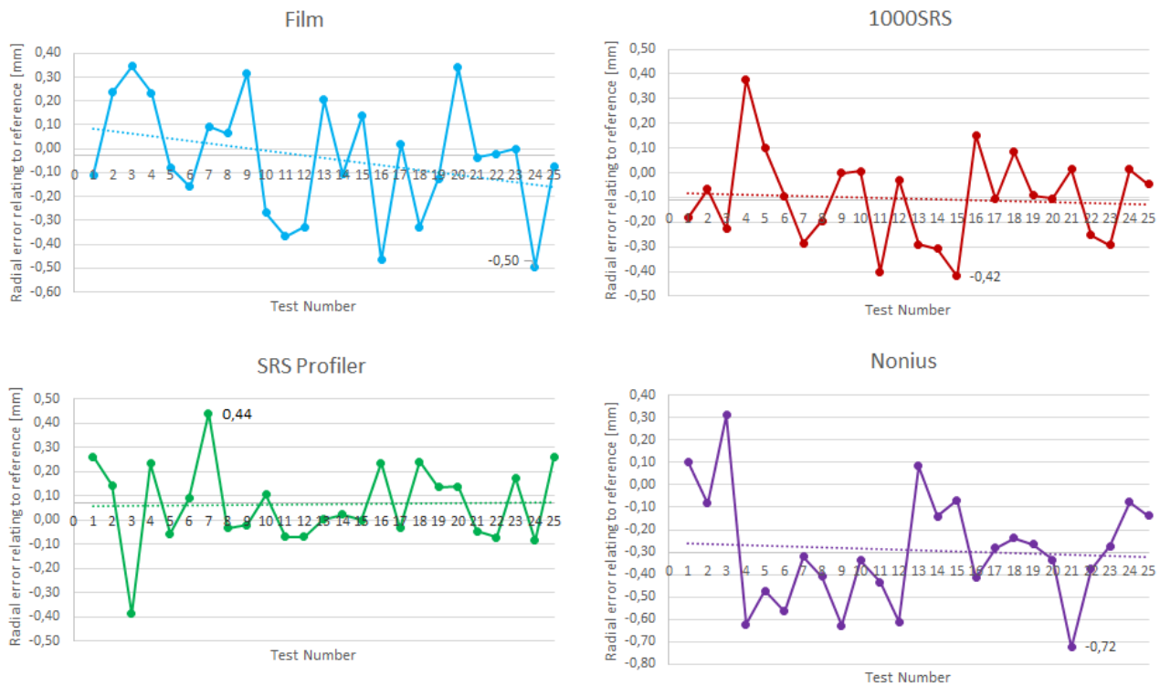
Figure 2: Results for the radial error in relation to the according baseline reference value of all three high-resolution arrays and film.