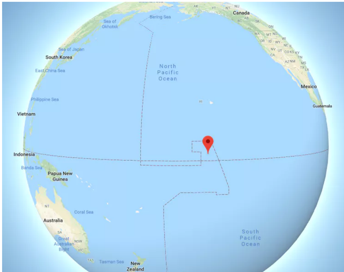
The tiny atoll of Kiritamati in the centre of the Pacific Ocean.

Between May 1957 and September 1958, the British government tested nine thermonuclear weapons on Kiritimati for Operation Grapple. Then, in 1962, the UK cooperated with the US on Operation Dominic, undertaking a further 31 detonations on Kiritimati.