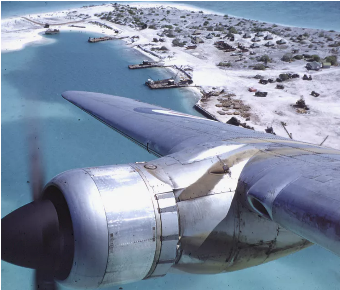
Flying over Kiritimati in 1956.