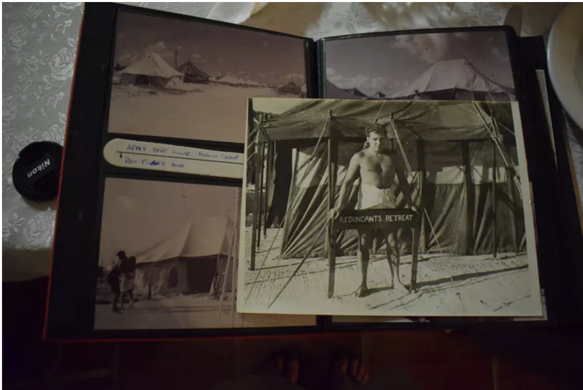
Photos of nuclear test veteran life.

His experiences of lax health and safety echo those of many nuclear test veterans interviewed during my research. He said that his section “witnessed five blasts, two A-bombs and three H-bombs on the beach in 1958”.