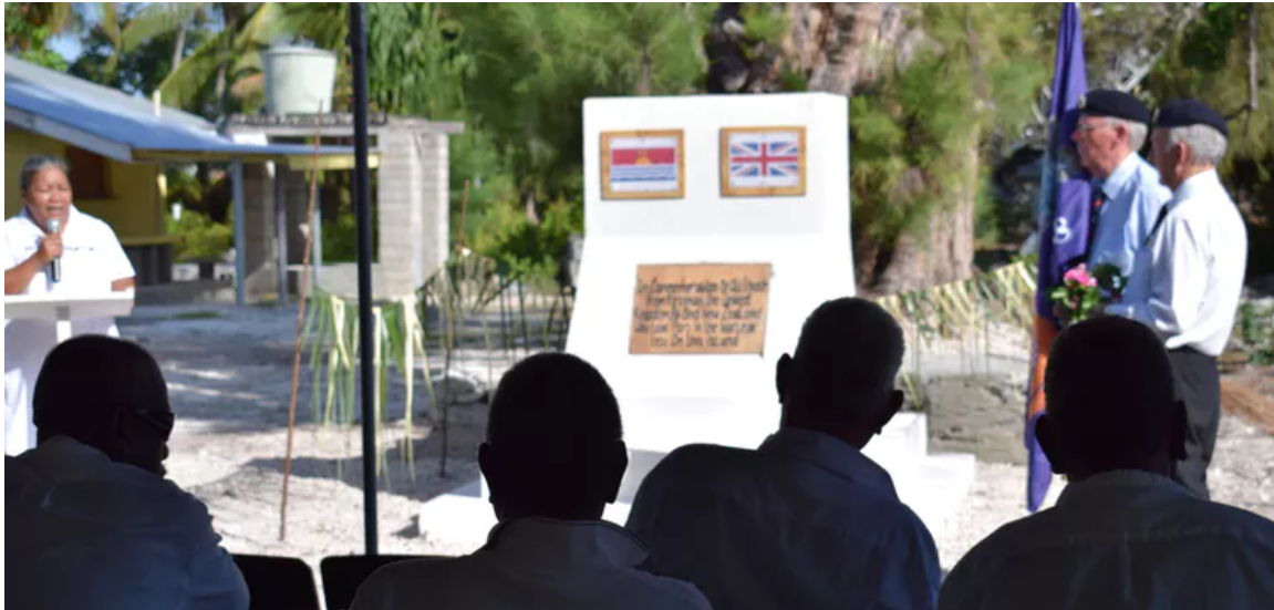
The British nuclear test veterans undertake their memorial ceremony in Kiritimati, in 2018.

This was the first time that veteran and islander communities were able to connect, share their experiences, and look to the future.