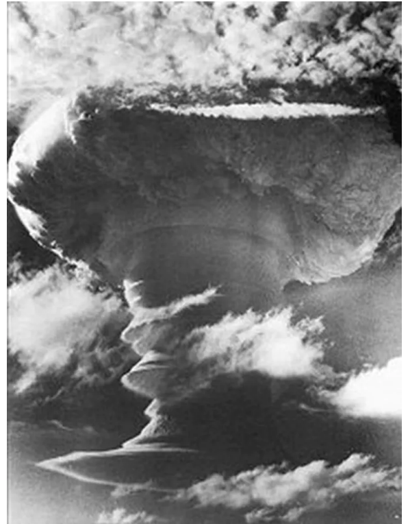
Operation Grapple X, Kiritimati, November 8 1957.