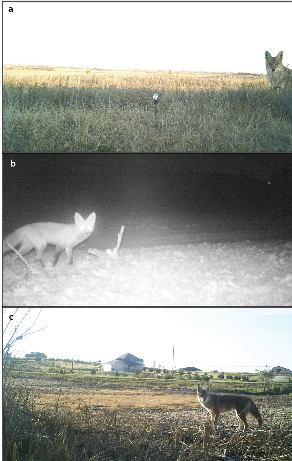
Fig. 2. Example of images captured by students on camera traps. (a) coyote ( Canis latrans ), (b) red fox ( Vulpes vulpes ), (c) coyote.