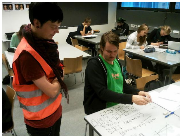
Figure 1. The instructor (in an orange vest) discusses the solution with a student in the XA classroom. [Published with permission from participants.]

The idea of the XA is to offer students individual instruction that is easily available. It has been noted that students are reluctant to ask for help even if it is offered. A number of measures were taken in order to make the students feel that they were expected to ask for instruction. The instructors wore orange vests with the print “Instructor”. Also, their names and photographs were posted on the wall. Students entering the classroom should not need to think twice whether they were allowed to ask for instruction. A typical scene from the XA classroom can be seen in Figure 1.