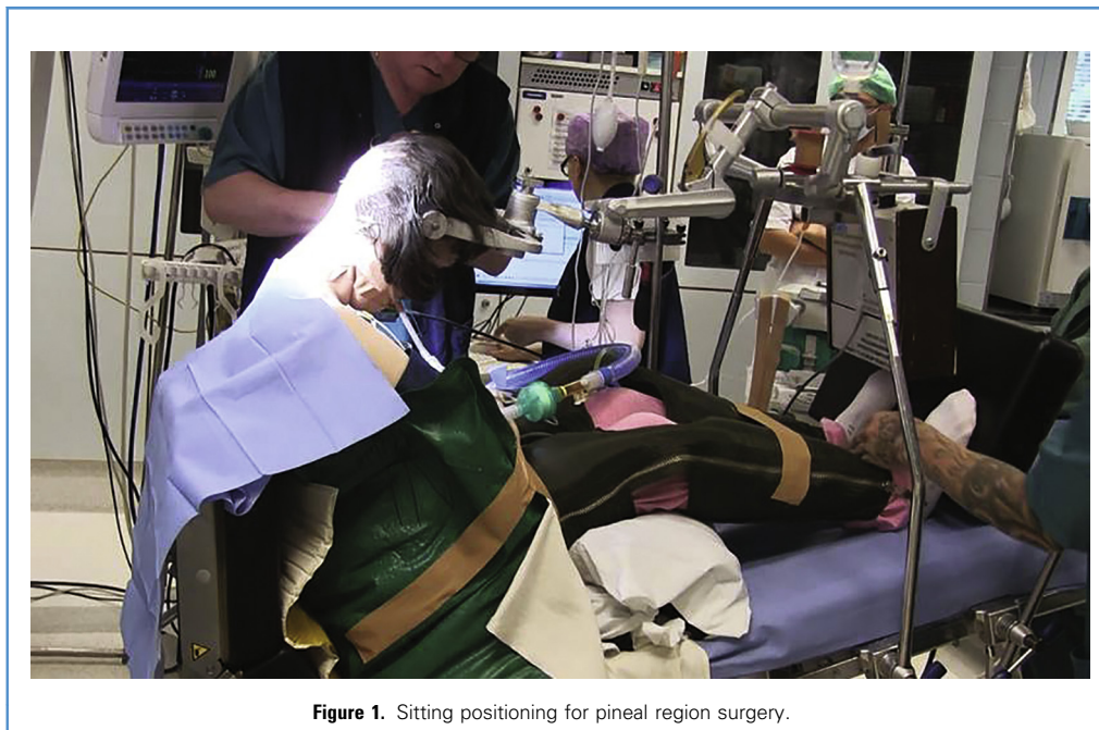
Figure 1. Sitting positioning for pineal region surgery.

the patient in a systematic sequence ( Figure 2 ). Two aspects are notable: 1) the adhesive borders of a light single-use surgical dressing are attached to the drape, and both elements are fixed with adhesive films; 2) despite the dressing, the anesthesiologist has free access to both jugular veins. As shown in Video 1 , a protocolized sitting positioning may be performed in <5 minutes for a normal-weight adult.