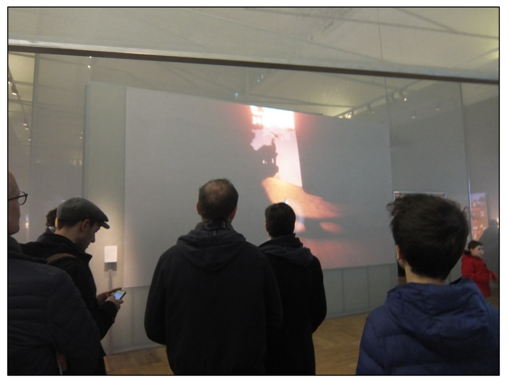
Figure 1. Visitors watch sections of playthrough of Journey projected on a large screen. Victoria and Albert Museum, London.

The next three games all AAA - the are classification given to games produced with the highest budgets and by large teams, often from several different companies (Lipkin 2013: 9). These games: The Last of Us (Naughty Dog, USA); Bloodborne (FromSoftware, Japan). and Splatoon (Nintendo Co., Japan), hail from different countries and cover quite different themes. These range from post-apocalyptic adventure, to gothic horror. to a team-based playful (and non-violent) shooting game.