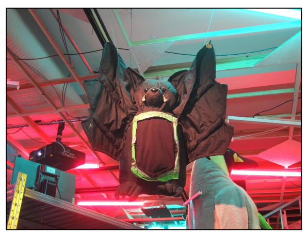
Figure 5. Bat backpack repurposed to act as a gaming console in "Player_Offline." Victoria and Albert Museum, London.

Towards the end of the exhibition, before the dedicated gift shop, is a final gallery that exhibits the DIY gaming scene – entitled, as a mirror complement, "Players_Offline." Here the video gaming equivalent of outsider art is to be found, as the introductory text says: "This is a punk scene. Nothing is predictable. Anything is possible." Again, the very material aspect is more than apparent with home-made arcade consoles, and repurposed objects turned to games including backpacks and even sections of cars (figures 5 and 6). It is also a space packed with robust interactive opportunities, and serves a second purpose as a place in which especially younger visitors can run around and effectively let off steam after the more didactic sections that preceded. This is an excellent strategy, and allows some release for visitors before leaving the exhibition.