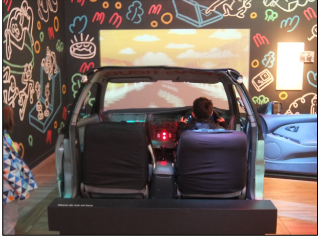
Figure 6. Front half of car repurposed for gaming in "Player_Offline," and open for visitors to experience for themselves. Victoria and Albert Museum, London.