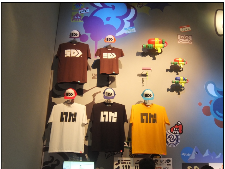
Figure 10. Merchandise connected to Splatoon. Victoria and Albert Museum London.

Materiality is also expressed through the associated merchandise that accompanies games. Quite aside from sales of the devices themselves – PCs, mobile phones, different gaming consoles – and selling the games themselves, certain games such as Splatoon spawn their own merchandise through which fans can express their appreciation of the game, but also their affiliations within the game itself (figure 10).