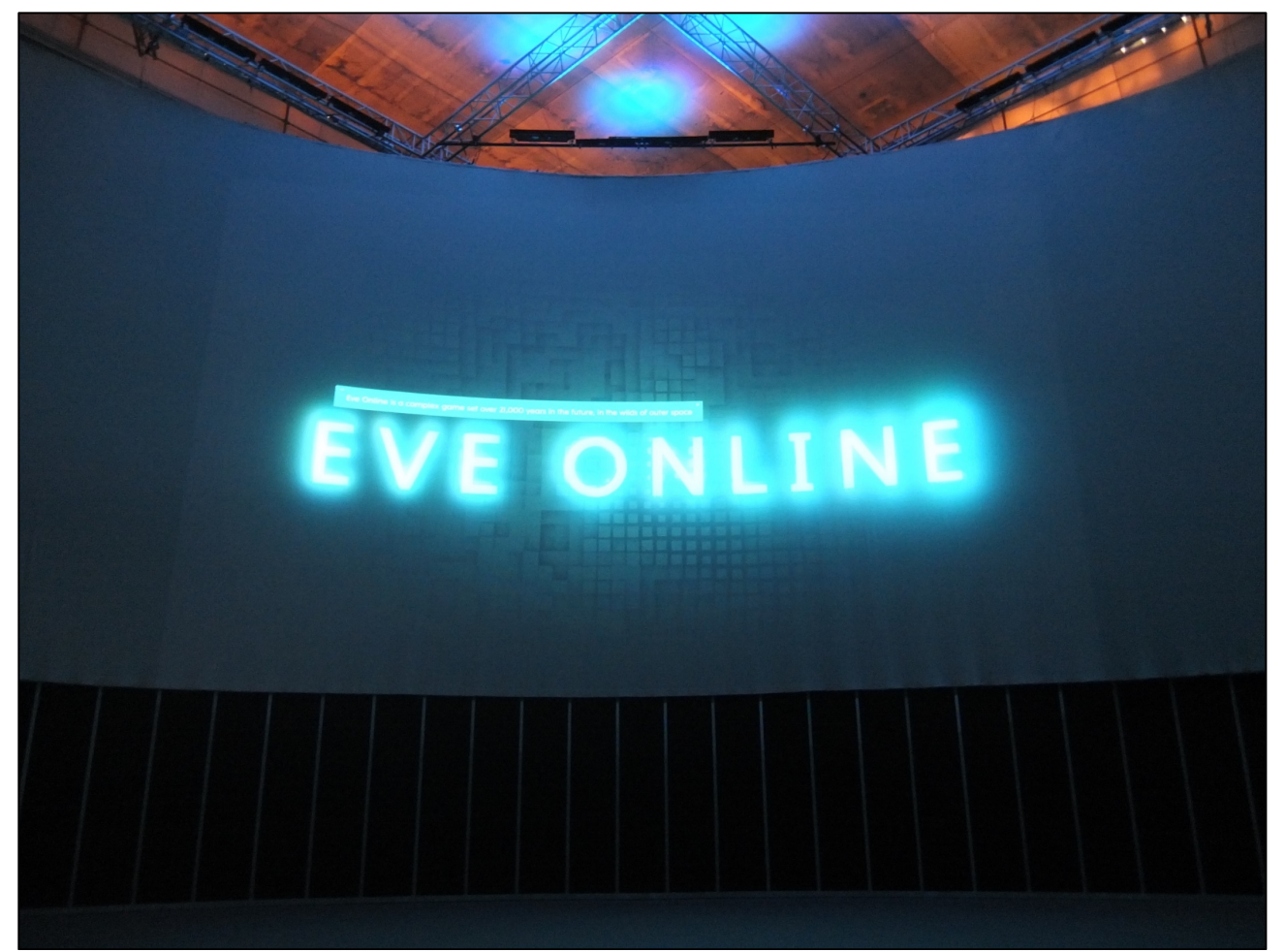
Figure 4. Cinematic scale montage of global gaming trends such as tournaments and fan culture in "Player_Online." Victoria and Albert Museum, London.

Visitors encounter more visual spectacle as they enter the cavernous "Players_Online" exhibition space (figure 4). Another striking feature of the whole exhibition that one takes away is the sheer scale of the videogaming "scene" in general. Although verging on overwhelming in places, the exhibition succeeds at showing the visitor not only the diversity of games themselves – ranging from the high profile AAA-produced games to the smaller independent and sometimes experimental pieces – but also the scale at which video gaming has taken the world by storm.