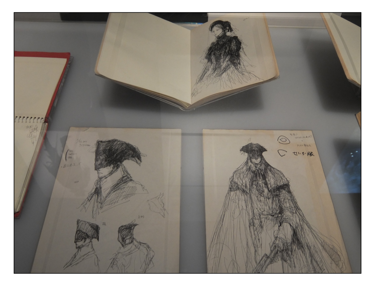
Figure 9. Hand-drawn sketches of possible characters for Bloodborne . Victoria and Albert Museum, London.