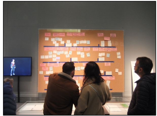
Figure 8. Visitors examine the post-it notes and board that designers of The Last of Us used to plan the play and storyline. Victoria and Albert Museum, London.