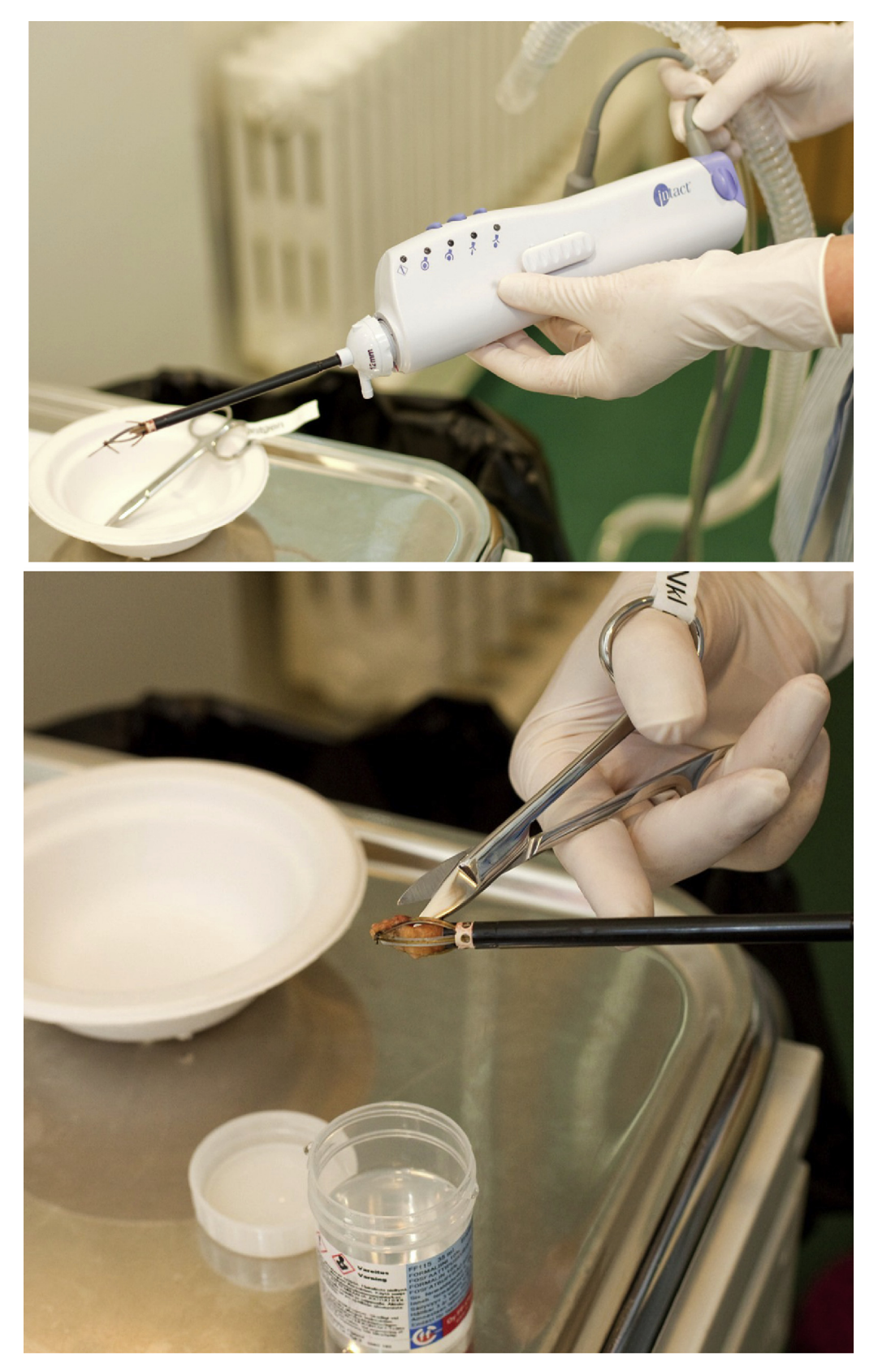
Fig. 1. The Breast Lesion Excision System (Intact ^{\text{TM}} ).