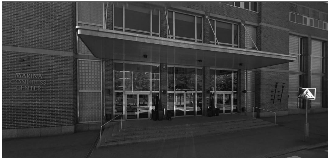
Scandic Marina Congress Centre street view. Map and figure from Google