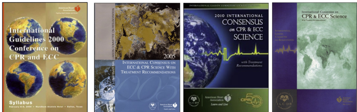
Fig. 2. ILCOR major guidelines/evidence evaluation conferences.

The 1997 ILCOR Advisory Statement focused on what we now call acute coronary syndrome from the standpoint of encouraging prompt recognition as a means to deliver key interventions to prevent cardiac arrest [24]. The section on special circumstances stated “if cardiac arrest has not yet occurred, ECG clues