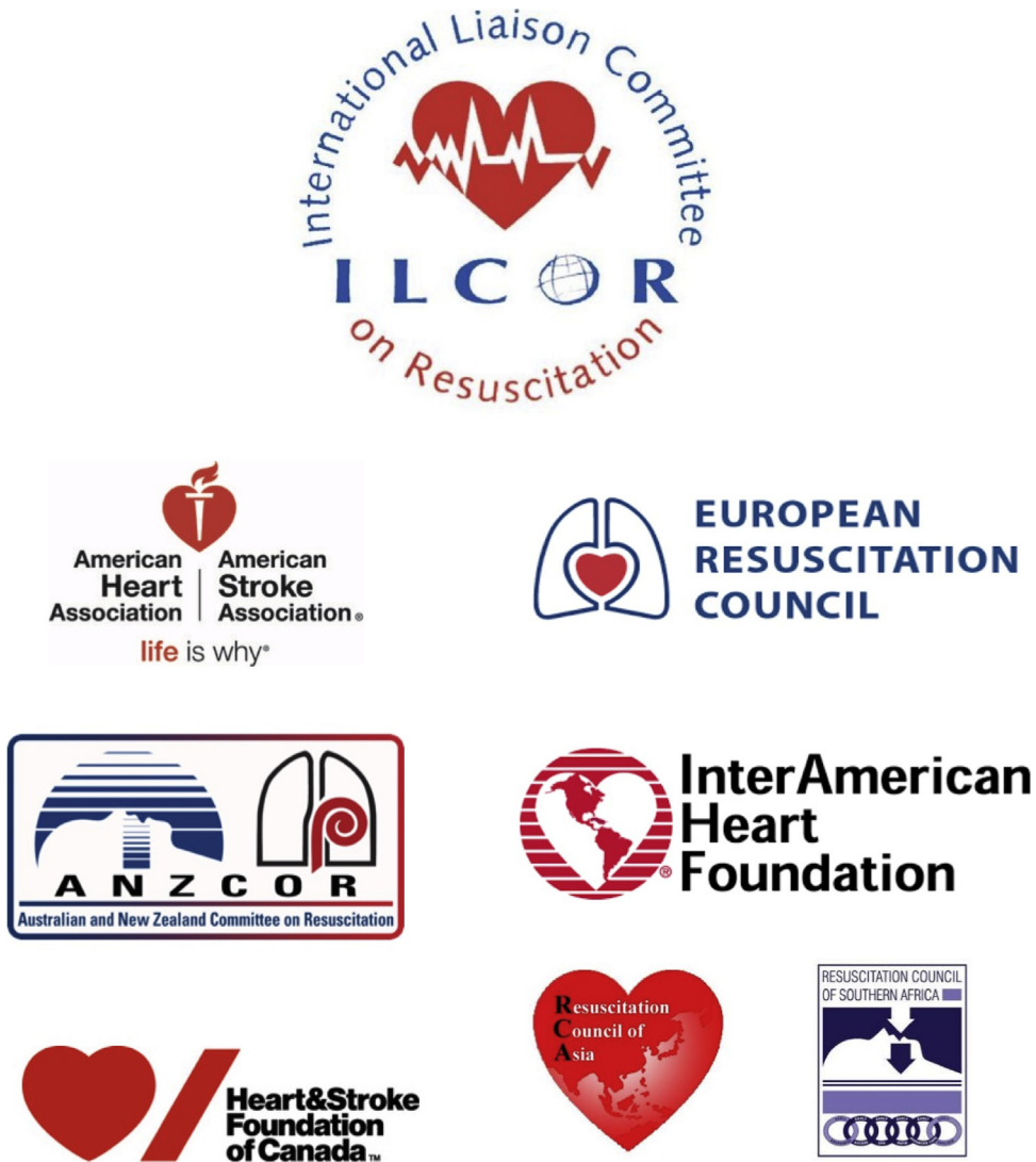
Fig. 1. ILCOR member organisations.

CPR devices, and uncertainty about the role of drugs (adrenaline and amiodarone). Post resuscitation care included the concept of TTM (targeted temperature management) with a target temperature between 32 and 36°C, and the need for delayed (more than 24 h after ROSC) multimodal prognostication in comatose cardiac arrest survivors.