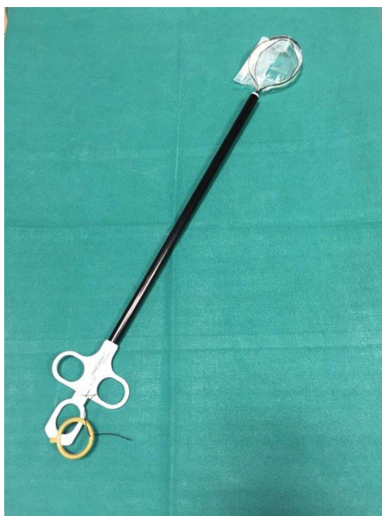
Picture 2. Endobag use in lower transabdominal group.

The edges of the bag were pulled out of the abdominal cavity, opened and the fluid removed by suction, after which the bag with all remaining contents was removed. The fascia at the umbilicus was closed under direct visual control with 0-Vicryl sutures using a traditional needle holder. The fascias at the 5-mm incisions were not closed. The skin incisions were closed with absorbable sutures. At the end of the operation 20 ml of 7.5% ropivacain was infiltrated to the trocar incisions, 5 ml to each.