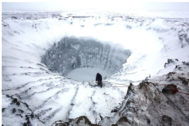
Figure 3. New crater produced by gas explosion on the Yamal Peninsula in 2014 (Leybman et al., 2015).

et al., 2014). This tendency is favourable for exploring and transporting northern Siberian oil and gas, comprising about 25 % of total world resources (Yenikeyeff and Krysiak, 2007).