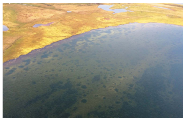
Figure 2. Photo of a lake on the Yamal Peninsula showing numerous craters from gas explosions on the lake bottom (Bogoyavlensky, 2015).

Permafrost leaves imprints in the gravity field, as in the case of the Hudson Bay, where the gravity field is lower than elsewhere at this latitude (Tamisiea et al., 2007), possibly as a consequence of the North American glaciation. About 75 000 years ago ice (3.7 km thick in the Hudson Bay area) covered most of the present northern US and Canada, which has left a large depression. On the contrary, the gravity field over 1 km thick permafrost (such as in eastern Siberia) can reach 50 mGal. On the geological time scale, this field can