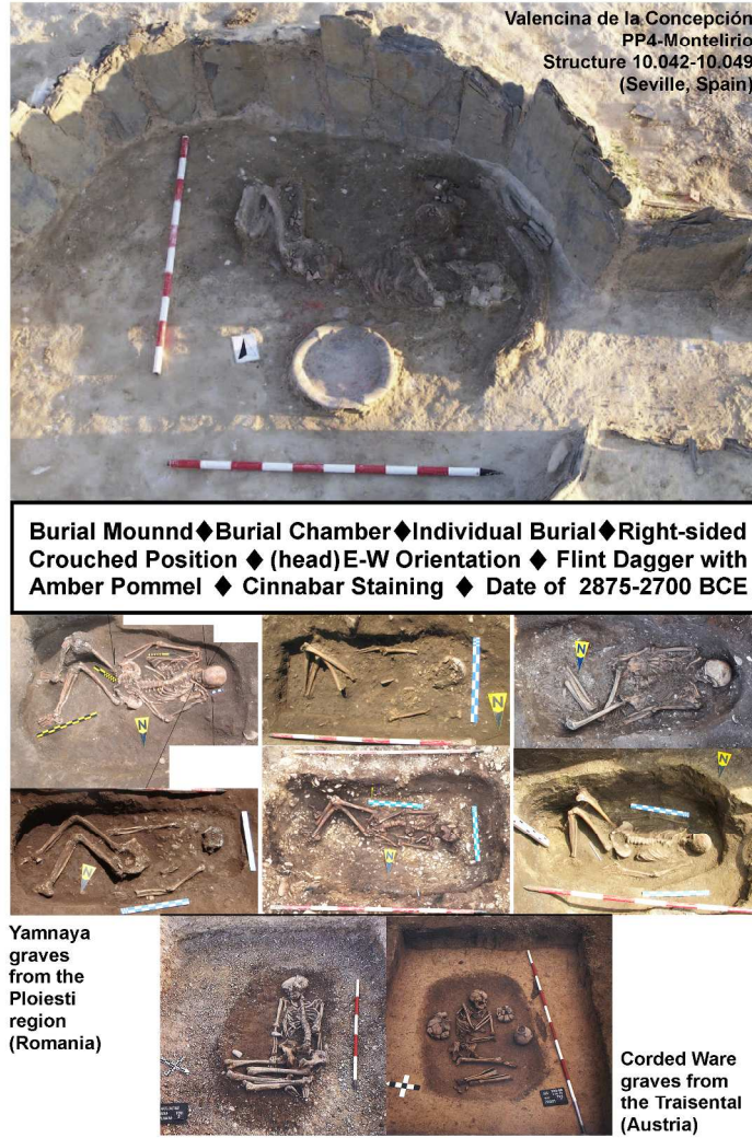
Figure 3. The burial of Valencina de la Concepción, PP4-Montelirio, structure 10.049 compared to Yamnaya/CWC graves in Romania and Austria (after García Sanjuán et al. [ed.] 2013, Frînculeasa et al. 2015 and Neugebauer 1987).