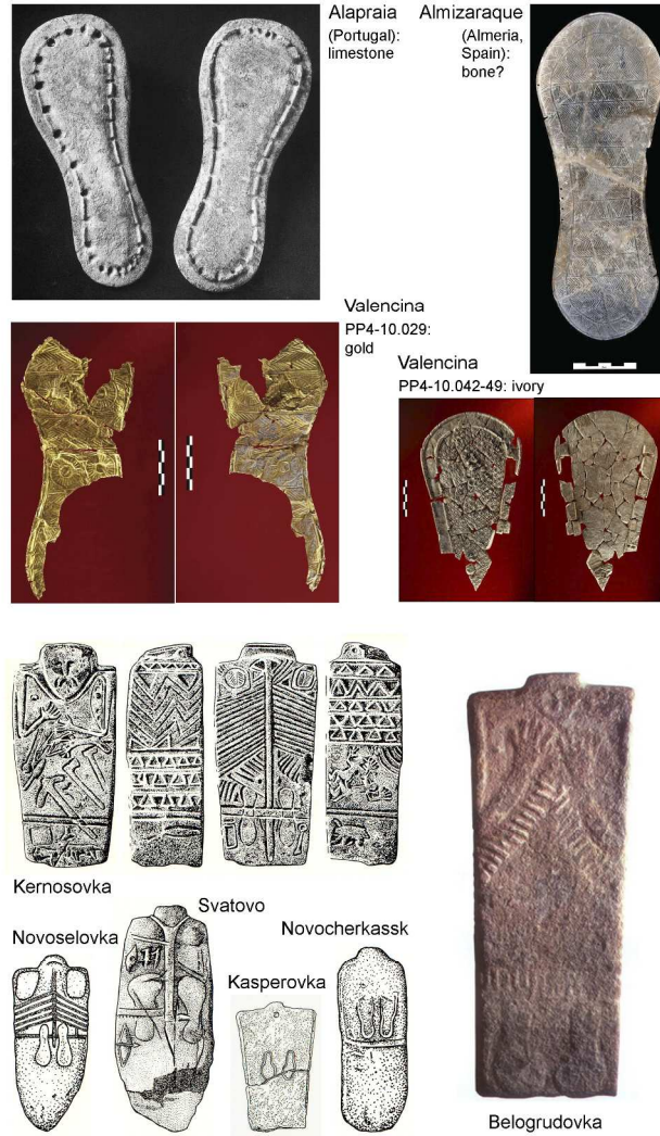
Figure 4. SANDALS/shoe representations from the Iberian Chalcolithic (top) and on Yamnaya stelae from the Ukraine (bottom) (after Murillo Barroso et al. 2015 [with further Iberian references on 'sandals'] & Telegin & Mallory 1994).