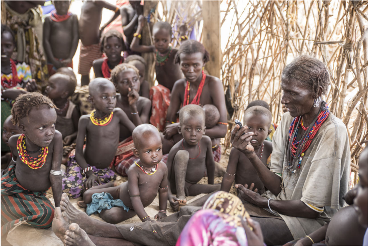
Figure 2 A Daasanach elderly woman records a traditional folktale in a storytelling session with young generations, as part of a participatory project aiming to revitalize traditional stories about wildlife in the surroundings of Sibiloi National Park, North Kenya.