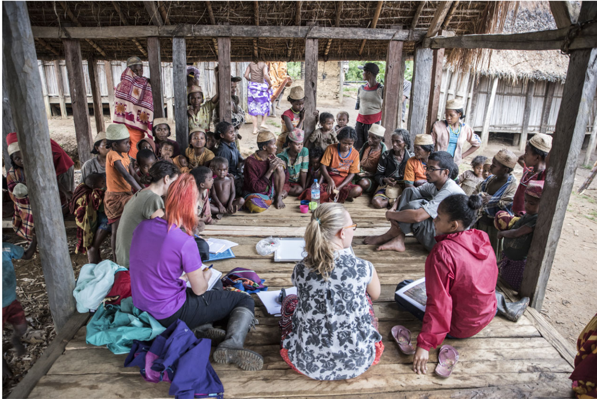
Figure 3 Students of conservation science listen to local stories to understand the context and challenges of conservation in the vicinity of Ranomafana National Park, Madagascar.

interests are advanced with the stories being revitalized, while also explicitly avoiding knowledge imposition and colonizing methodologies (Tuhivai Smith 1999; Pert et al. 2015). Here, we provide several guidelines that can help to nurture the conditions of trust and social equity needed for these projects to be legitimate and sensitive to the issue of assimilative practices of knowledge integration ( sensu Nadasdy 2003).