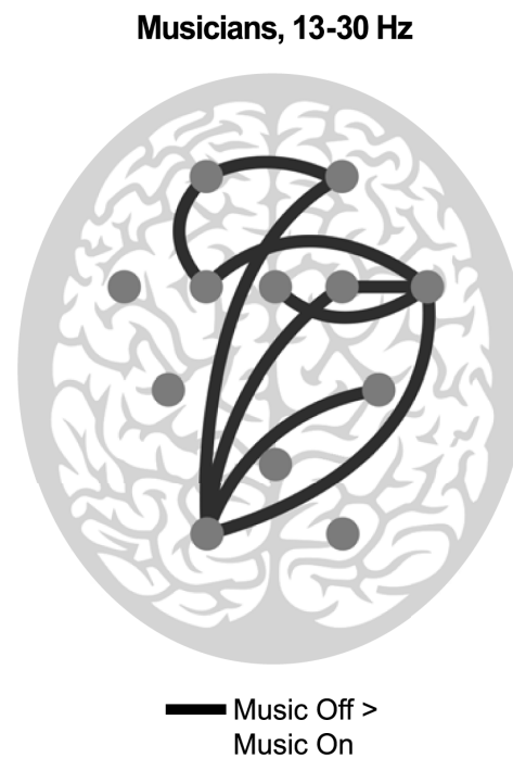
Fig 3. Significant differences for the main factor of Music (Music On, Music Off) for musicians in the beta band (13–30 Hz). The black lines connect the electrode pairs over which the synchronization is significantly stronger during Music On than during Music Off. Each gray dot illustrates the location of an EEG electrode on the scalp.

https://doi.org/10.1371/journal.pone.0196065.g003