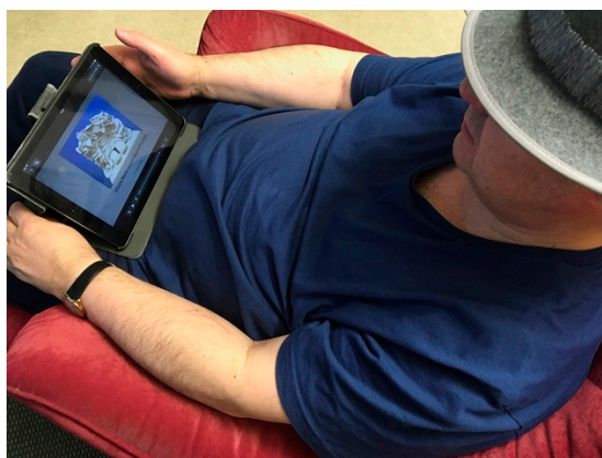
Figure 1. A deafblind CI user deflecting unwanted sounds by the use of a hat.

In finding solutions for technological malfunction or issues related to user experiences, the solution may be an individual "workaround" or something that several users have found useful (see also [7]). For example, deafblind people using CIs may enhance their acoustic environment through using a hat to deflect unwanted sounds (see Figure 1). The use of a wide hat also helps them to balance their own voice when producing vocalised sounds [26].