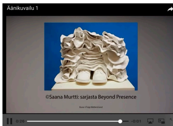
Figure 3. Sound description number 1 as it is presented on the website.