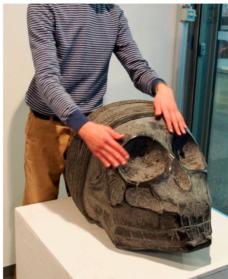
Figure 2. A deafblind visitor at the exhibition at Sanomatalo, 2016.