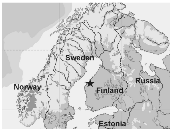
Fig. 1. Location of Levänluhta in Ostrobothnia, western Finland (black star).

KM21814:525 Levänluhta equine lower right premolar